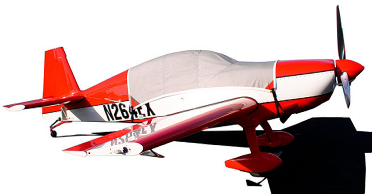
Canopy Cover for the Extra 300