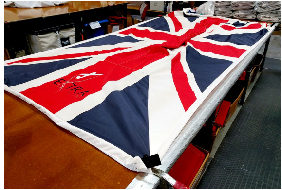
Custom Full-Cover Artwork