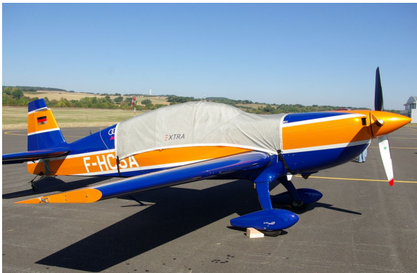
Extra 300L Canopy Cover

This cover type is made from Silver Acrylic Sunbrella canvas and is 100% lined with a soft and smooth microfiber. Bruce's Custom Covers developed this material combination especially for aircraft protection. The outer material is medium weight and treated for water resistance, UV resistance and anti-static buildup. The inner lining is a very soft and smooth microfiber to prevent scratching. The material is very reflective, and tests show that the cabin interior temperature can be reduced to near-ambient temperature on the hottest of days. It is water, ice and snow repellent, yet breathable to allow moisture to escape from between the cover and the aircraft surface.