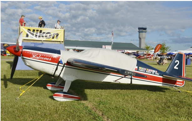
Extra 300 (mid-fuselage wing) Canopy Cover

Travel Covers are made with Silver Solution-Dyed Polyester fabric and only lined over the windshield to save weight. The material is lightweight and more compact for easy stowage in the aircraft. The polyester material is water resistant, but only intended for occasional use outside. We also have an ultra lightweight material available for fitted hangar dust covers. For daily outdoor use, the non-travel Sunbrella Cover is the best choice.