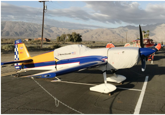
Extra 300S Canopy & Engine Covers