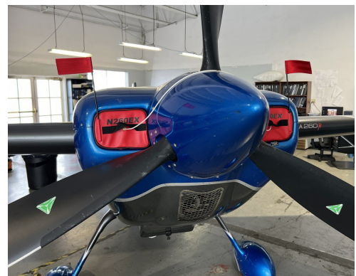
Extra 260 Engine Inlet Plugs