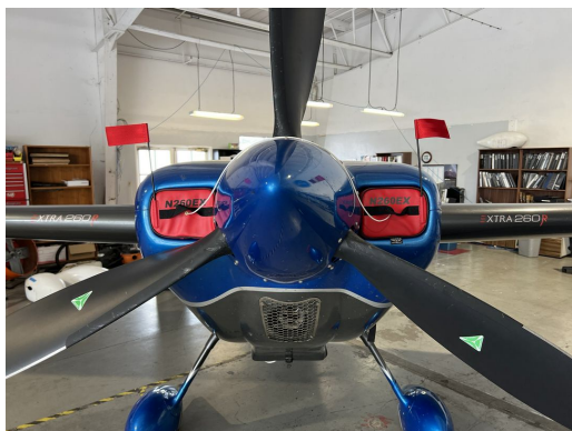
Extra 260 Engine Inlet Plugs

Engine Inlet Plugs are custom fit for your Extra 300, 330SC, 330SX & 200/230 Models intakes, made with heavy-duty vinyl material, and stuffed with a single block of sculpted urethane foam. Each plug has a zipper that allows the foam to be removed and dried if necessary. Engine plugs have warning flags that are visible from the cockpit or 'remove before flight' streamers sewn onto the face of the plugs. Most plugs are imprinted with the aircraft registration number in black for an extra charge. Storage bag NOT included. Engine plugs may be inserted after flight when the engine is still warm. Engine Inlet Plugs are commonly referred to as Cowl Plugs, Intake Plugs, Cowl Blocks, Engine Blocks, and Engine Bungs.