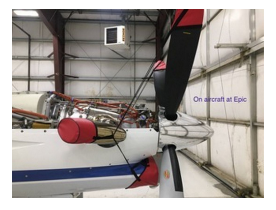
Epic Aircraft Prop Tie, Exhaust & Intake Covers

Engine Inlet Plugs are custom fit for your Epic E1000 intakes, made with heavy-duty vinyl material, and stuffed with a single block of sculpted urethane foam. Each plug has a zipper that allows the foam to be removed and dried if necessary. Engine plugs have warning flags that are visible from the cockpit or 'remove before flight' streamers sewn onto the face of the plugs. Most plugs are imprinted with the aircraft registration number in black for an extra charge. Storage bag NOT included. Engine plugs may be inserted after flight when the engine is still warm. Engine Inlet Plugs are commonly referred to as Cowl Plugs, Intake Plugs, Cowl Blocks, Engine Blocks, and Engine Bungs.