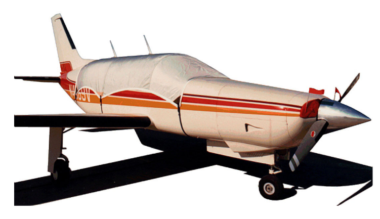
Piper Malibu/Mirage/Meridian Extended Canopy Cover