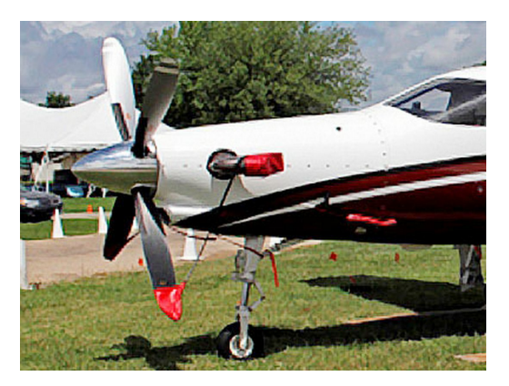
Epic Prop Tie-down/Exhaust cover set