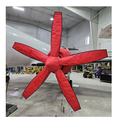
Fairchild Metro 5 Blade Insulated Insulated Prop Covers

This cover type is made from Silver Acrylic Sunbrella canvas and is 100% lined with a soft and smooth microfiber. Bruce's Custom Covers developed this material combination especially for aircraft protection. The outer material is medium weight and treated for water resistance, UV resistance and anti-static buildup. The inner lining is a very soft and smooth microfiber to prevent scratching. The material is very reflective, and tests show that the cabin interior temperature can be reduced to near-ambient temperature on the hottest of days. It is water, ice and snow repellent, yet breathable to allow moisture to escape from between the cover and the aircraft surface.