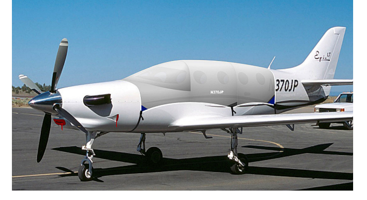
Epic LT Canopy Cover & Engine Plugs