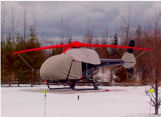
EC-130 Bubble, Engine, Rotor Hub, Blade & Tailfan Covers