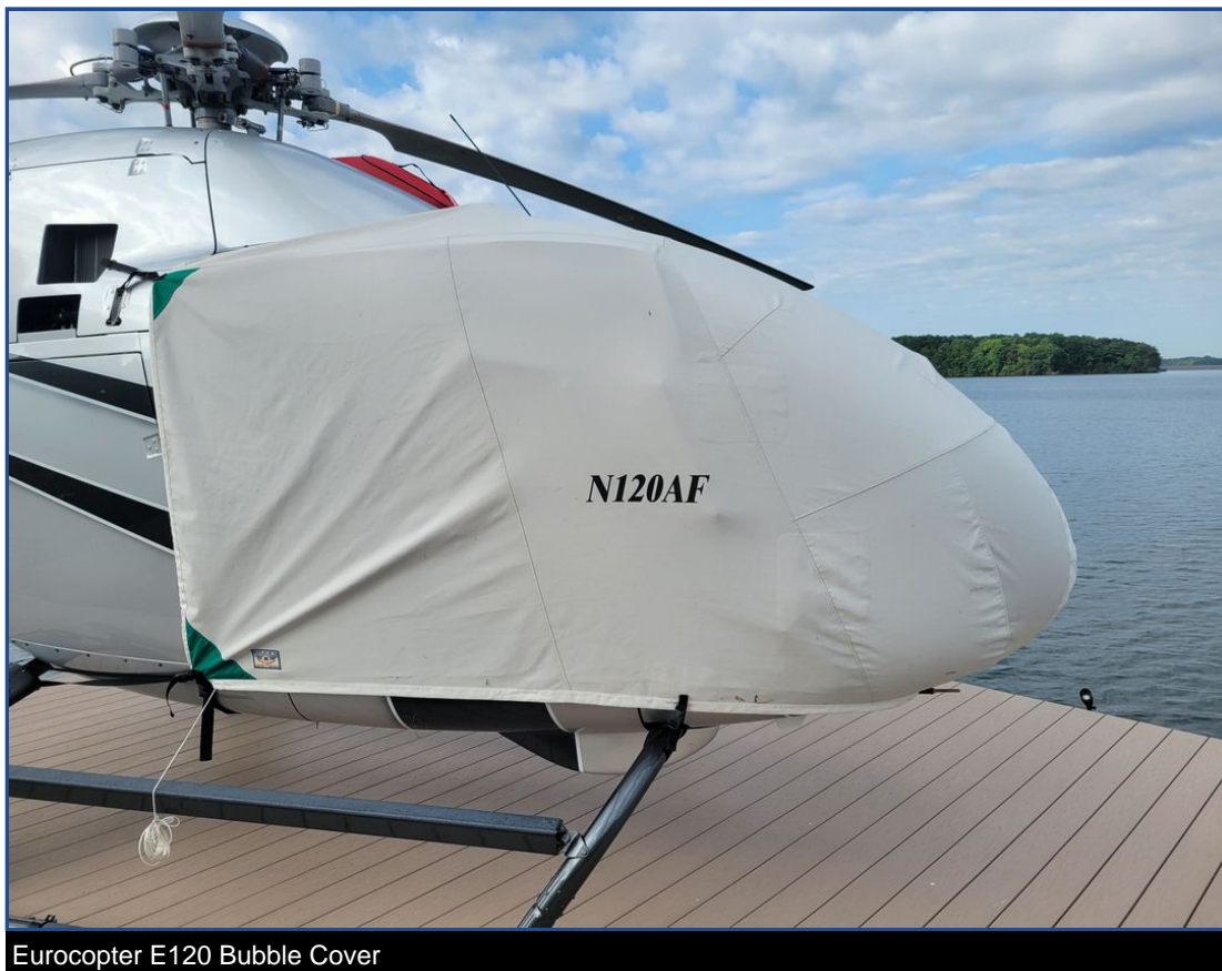
Eurocopter E120 Bubble Cover