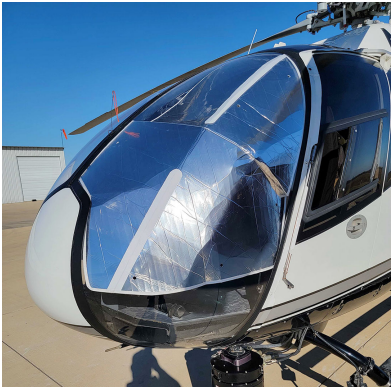
Eurocopter EC-120 Windshield HeatShields