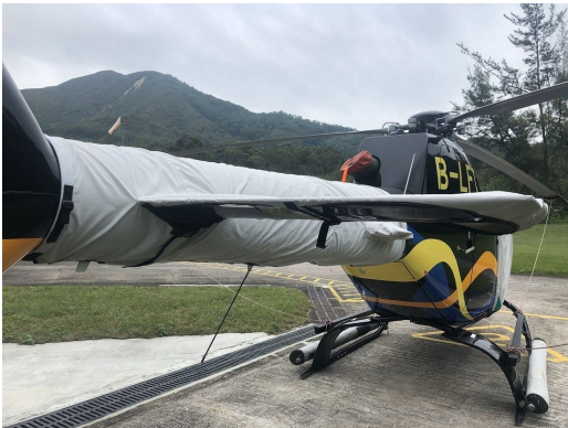
Eurocopter EC-120B Tailboom Cover

The Tailboom Cover details vary by model, but generally the helicopter tail boom cover encloses the tail boom from the "bottleneck" to the aft end. They usually also cover the horizontal stabilizers, and are custom made to allow for antennae, lights, and other protrusions. They attach with straps underneath the tail boom. Covers for the vertical and horizontal stabilizers are also available separately. Specific information for each model is available on request.