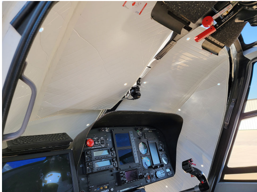
Eurocopter EC-120 Windshield HeatShields

Heatshields are interior sunshades for an aircraft's windows or canopy glass. The product is a unique composite of closed-cell foam with a silver mylar finish. The semi-rigid design is stiff enough to stand along the inside of the windshield using sun visors or window framing. It folds up flat and easily stores in the included storage sleeve. Some designs may require velcro and suction cups. A Heatshield is an excellent short-term remedy for cockpit overheating.