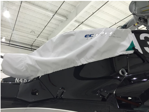
EC-130 Engine Area/Exhaust Cover

Insulated Covers Material - A special composite material of solution-dyed polyester, 3M Thinsulate insulation, and soft nylon interior fabric. Our insulated covers are designed to complement an engine preheater and help retain heat in the engine compartment after shutdown. If you operate your aircraft in cold-weather, these covers will help prevent engine wear and tear.