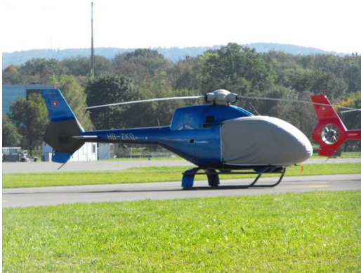
EC-130 Bubble, Tailfan, and Rotor Hub Cover