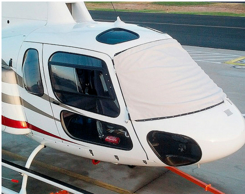
AS350 Windshield Cover, pinches in door jambs