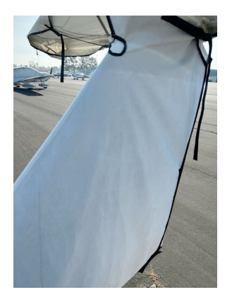
Dimona HK-36 Empennage Cover Set