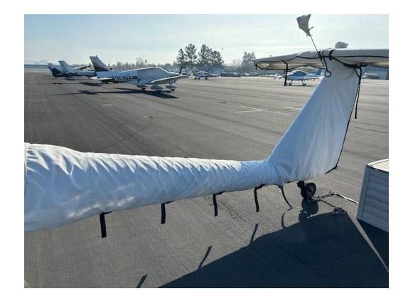
Dimona HK-36 Empennage Cover Set

WINTER USE MATERIAL - Made with Solution-Dyed Polyester fabric, this option is intended for seasonal use to aid in deicing, rain mitigation, or for occasional travel. The material is lighter and more compact, but more susceptible to UV damage and may have a shorter useful life if used continuously outside than the all-year use material.