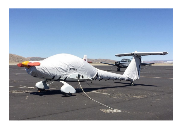
Diamond DA-20 Canopy Cover