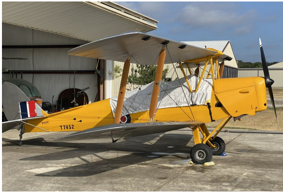
Dehavilland DH-82 Tiger Moth Canopy Cover