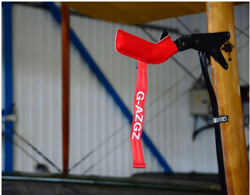
DeHavilland DH-82 Tiger Moth Pitot Cover

DeHavilland DH-82 Tiger Moth Pitot Tube Covers , NOT HEAT RESISTANT TYPE, are made of Naugahyde vinyl, and are designed to cover the entire pitot assembly. Slipping over the tube, the cover tightens around the base with a Velcro strap detail. A "Remove Before Flight" streamer is attached to the cover. Heat Resistant Pitot Covers are an upgrade to this design, and help prevent the pitot cover from melting onto the tube if the pitot heat is accidentally turned on while installed. If you want the set tethered together, please let us know.