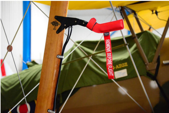
DeHavilland DH-82 Tiger Moth Pitot Cover