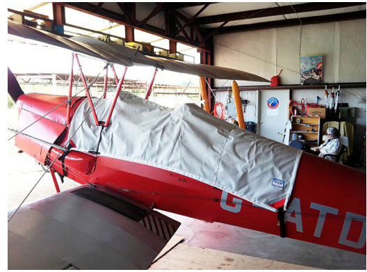
Canopy Cover for the De Havilland Tiger Moth