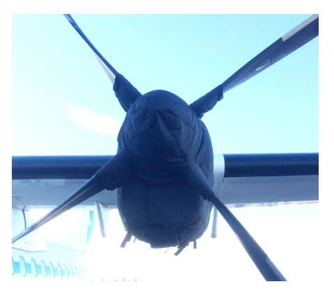
ATR-72-202 Insulated Engine & Prop Hub Covers