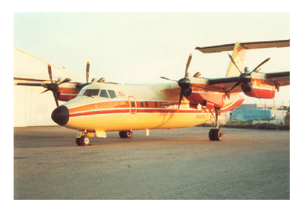
Covers & Plugs for the Dash 7