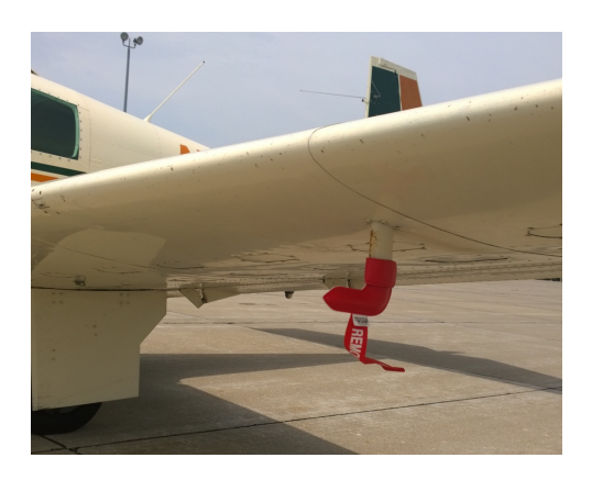
Mooney Pitot Cover