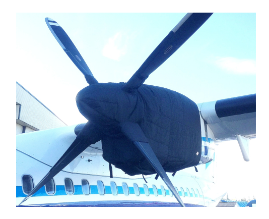
ATR-72-202 Insulated Engine & Prop Hub Covers