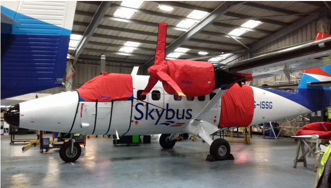
DeHavilland Twin Otter DHC6 (UV-18A) Cockpit Cover (CUSTOM COLOR)

water resistance, UV resistance and anti-static buildup. The inner lining is a very soft and smooth microfiber to prevent scratching. The material is very reflective, and tests show that the cabin interior temperature can be reduced to near-ambient temperature on the hottest of days. It is water, ice and snow repellent, yet breathable to allow moisture to escape from between the cover and the aircraft surface.