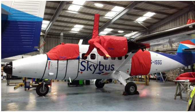
DeHavilland Twin Otter DHC6 (UV-18A) Cockpit Cover (CUSTOM COLOR)