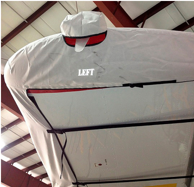
De Havilland Twin Otter Wing Cover wing tip detail

WINTER USE MATERIAL - Made with Solution-Dyed Polyester fabric, this option is intended for seasonal use to aid in deicing, rain mitigation, or for occasional travel. The material is lighter and more compact, but more susceptible to UV damage and may have a shorter useful life if used continuously outside than the all-year use material.