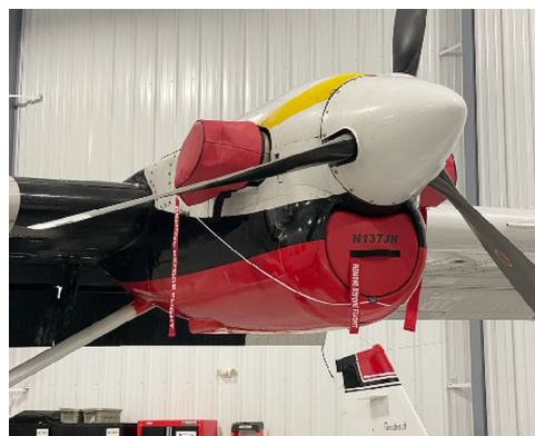
De Havilland Twin Otter Insulated Engine & Insulated Propellor/Spinner Covers DeHavilland DH-6 Intake Plugs, Exhaust Covers