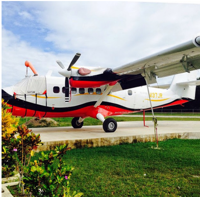
Twin Otter Cockpit Cover & Engine Plugs