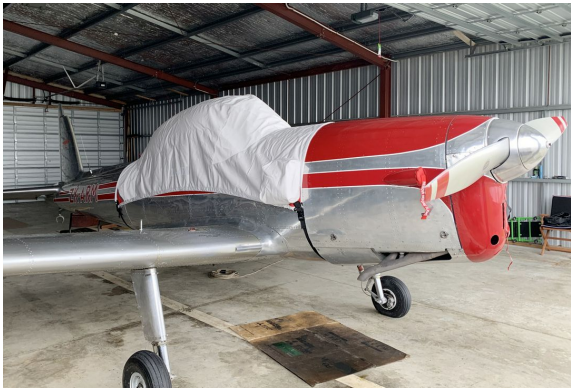
Chipmunk DHC-1A-1 Canopy Cover