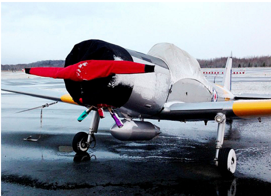
De Havilland DH1 Chipmunk Canopy Cover (English Canopy), & Prop Cover