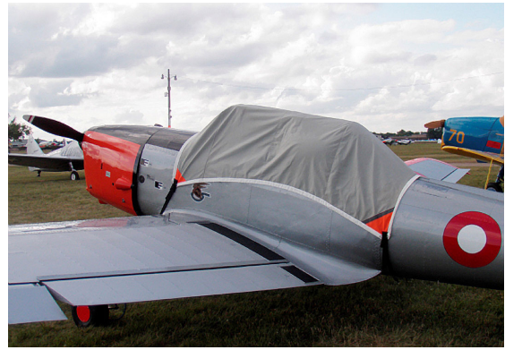
De Havilland DH1 Chipmunk Canopy Cover (English Canopy)