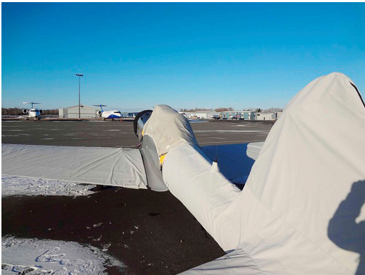
De Havilland DH1 Chipmunk Engine, Wings, Canopy and Empennage Covers