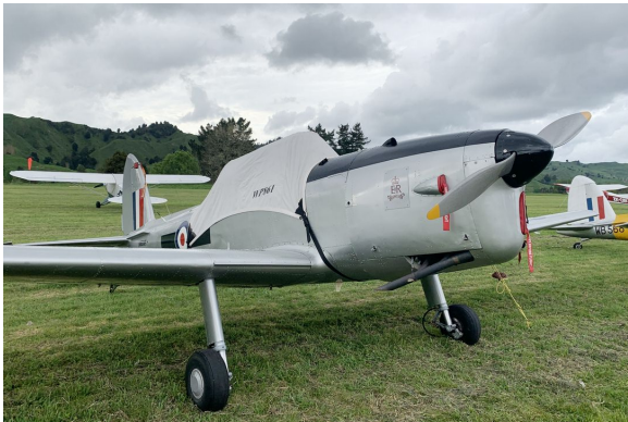
DeHavilland Chipmunk Canopy Cover, Engine Plugs

This cover type is made from Silver Acrylic Sunbrella canvas and is 100% lined with a soft and smooth microfiber. Bruce's Custom Covers developed this material combination especially for aircraft protection. The outer material is medium weight and treated for water resistance, UV resistance and anti-static buildup. The inner lining is a very soft and smooth microfiber to prevent scratching. The material is very reflective, and tests show that the cabin interior temperature can be reduced to near-ambient temperature on the hottest of days. It is water, ice and snow repellent, yet breathable to allow moisture to escape from between the cover and the aircraft surface.