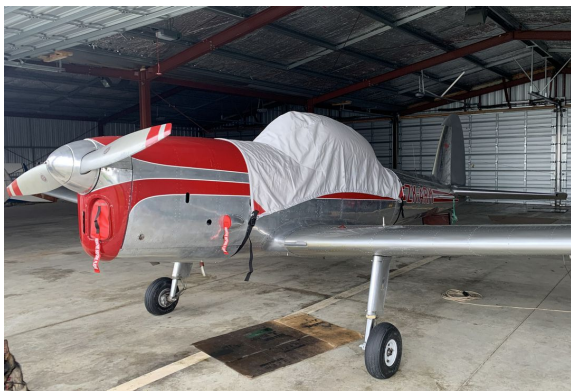
Chipmunk DHC-1A-1 Canopy Cover, Engine Inlet Plugs