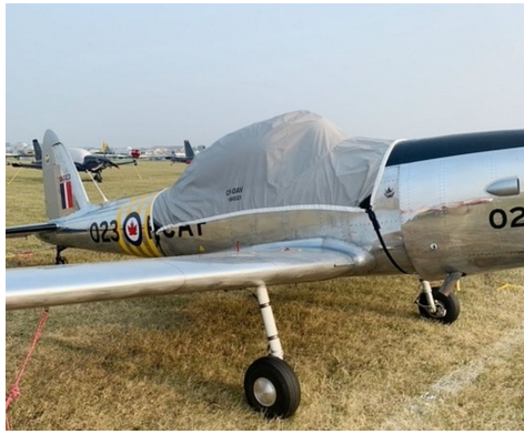
DeHavilland Chipmunk Travel Weight Canopy Cover