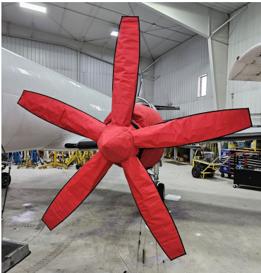
Prop Tie-Down, Various Models (secures with a hook to engine nacelle) Fairchild Metro 5 Blade Insulated Insulated Prop Covers