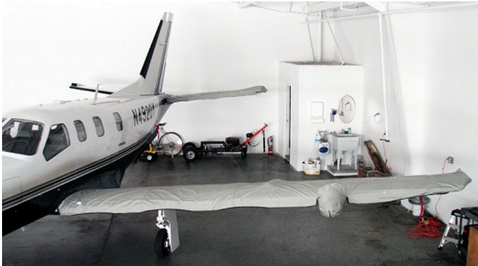
Pilatus PC-12 Wing Covers

WINTER USE MATERIAL - Made with Solution-Dyed Polyester fabric, this option is intended for seasonal use to aid in deicing, rain mitigation, or for occasional travel. The material is lighter and more compact, but more susceptible to UV damage and may have a shorter useful life if used continuously outside than the all-year use material.