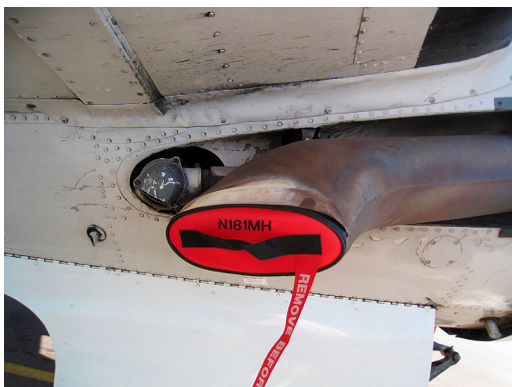
Beech 18 Exhaust Plugs

Engine Inlet Plugs are custom fit for your Douglas DC-3 intakes, made with heavy-duty vinyl material, and stuffed with a single block of sculpted urethane foam. Each plug has a zipper that allows the foam to be removed and dried if necessary. Engine plugs have warning flags that are visible from the cockpit or 'remove before flight' streamers sewn onto the face of the plugs. Most plugs are imprinted with the aircraft registration number in black for an extra charge. Storage bag NOT included. Engine plugs may be inserted after flight when the engine is still warm. Engine Inlet Plugs are commonly referred to as Cowl Plugs, Intake Plugs, Cowl Blocks, Engine Blocks, and Engine Bungs.