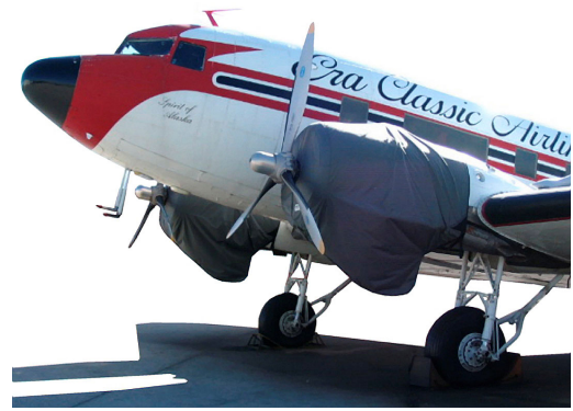
Engine Covers are available in either standard or insulated designs.