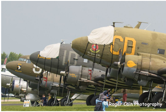
Douglas DC-3's with Cockpit Covers