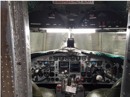
Douglas DC-3 Cockpit Heatshields