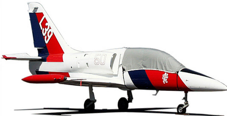
Canopy Cover for Aero L-39 Albatros

Travel Covers are made with Silver Solution-Dyed Polyester fabric and only lined over the windshield to save weight. The material is lightweight and more compact for easy stowage in the aircraft. The polyester material is water resistant, but only intended for occasional use outside. We also have an ultra lightweight material available for fitted hangar dust covers. For daily outdoor use, the non-travel Sunbrella Cover is the best choice.