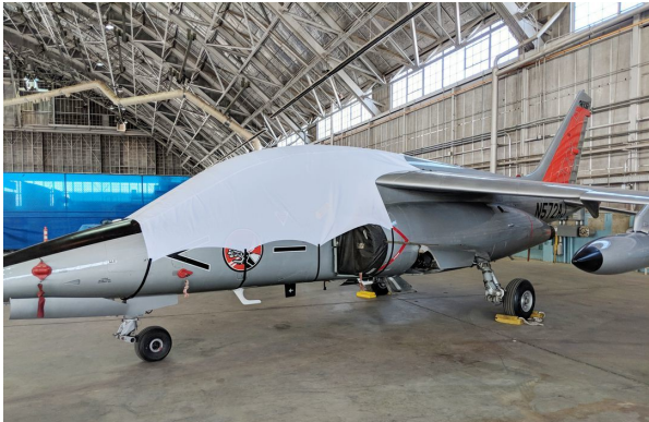
Dornier Alpha Jet Canopy Cover, test fit cover