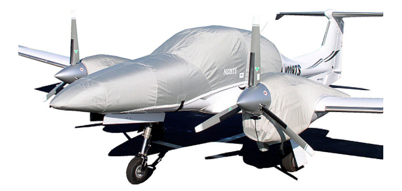
DA-42 Full Cover Set: Extended Canopy/Nose, Wing/Engine, Prop, Empennage