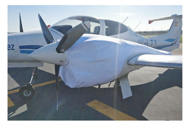
Diamond DA-42 Extended Canopy/Nose Cover, Engine Covers