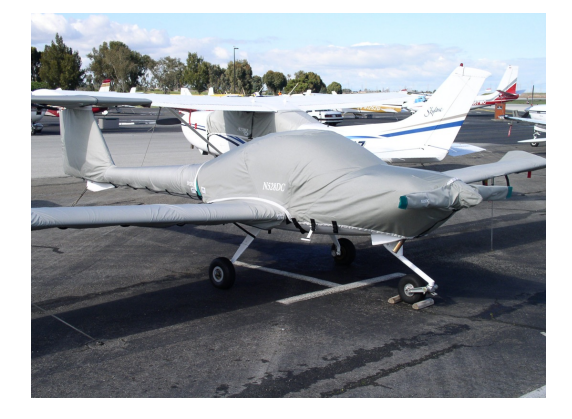
DA-20 Full Cover Set

This cover type is made from Silver Acrylic Sunbrella canvas and is 100% lined with a soft and smooth microfiber. Bruce's Custom Covers developed this material combination especially for aircraft protection. The outer material is medium weight and treated for water resistance, UV resistance and anti-static buildup. The inner lining is a very soft and smooth microfiber to prevent scratching. The material is very reflective, and tests show that the cabin interior temperature can be reduced to near-ambient temperature on the hottest of days. It is water, ice and snow repellent, yet breathable to allow moisture to escape from between the cover and the aircraft surface.