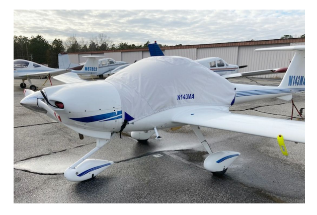
Diamond DA20-C1 Canopy Cover

This cover type is made from Silver Acrylic Sunbrella canvas and is 100% lined with a soft and smooth microfiber. Bruce's Custom Covers developed this material combination especially for aircraft protection. The outer material is medium weight and treated for water resistance, UV resistance and anti-static buildup. The inner lining is a very soft and smooth microfiber to prevent scratching. The material is very reflective, and tests show that the cabin interior temperature can be reduced to near-ambient temperature on the hottest of days. It is water, ice and snow repellent, yet breathable to allow moisture to escape from between the cover and the aircraft surface.