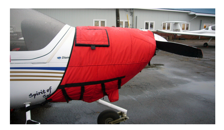
Diamond DA-20-C1 Insulated Engine Cover