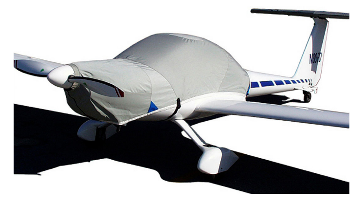
Diamond DA-20 Canopy/Engine Cover