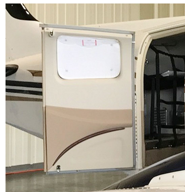
Beech Baron 58 Cabin HeatShield