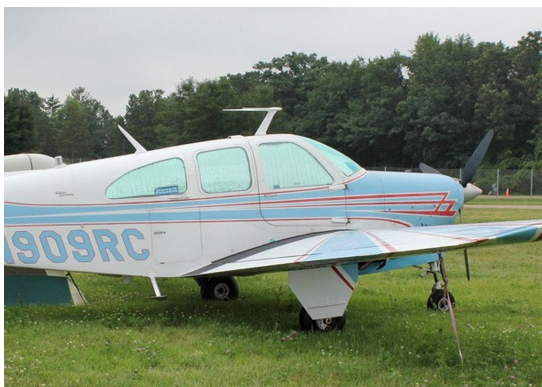
Beech Bonanza/Debonair HeatShield Set

Windshield Heatshields are interior sunshades for an aircraft's front windshield. The product is a unique composite of closed-cell foam with a silver mylar finish. The semi-rigid design is stiff enough to stand along the inside of the windshield using sun visors or window framing. It folds up flat and easily stores in the included storage sleeve. Some designs may require velcro and suction cups or split right and left sides. A Heatshield is an excellent short-term remedy for cockpit overheating. An external fabric cover is far more effective and practical for long-term protection.