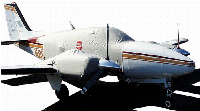
Standard Canopy Cover & Engine Plugs. Extended Canopy Cover & Engine Cover