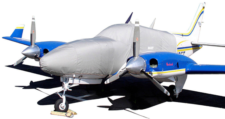
Baron Canopy/Nose Cover