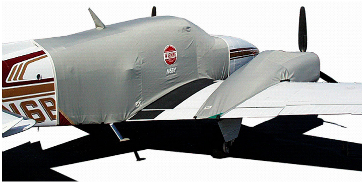
Baron Extended Canopy Cover & Engine Covers