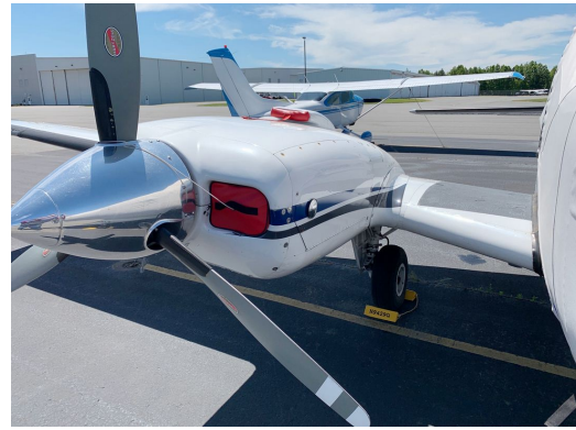
Beech Baron 58 Engine Plugs