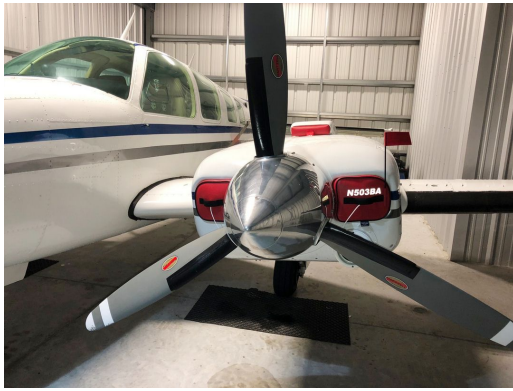
Beech Baron Engine Plugs