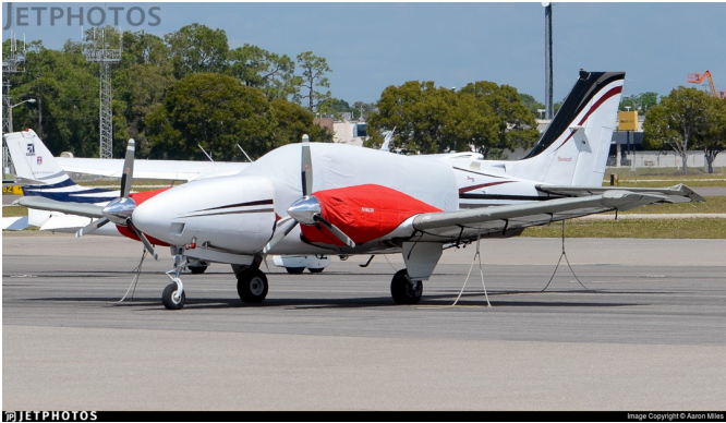
Beech Baron 58, G58 Canopy Cover, Insulated Engine Covers

The material is very reflective, and tests show that the cabin interior temperature can be reduced to near-ambient temperature on the hottest of days. It is water, ice and snow repellent, yet breathable to allow moisture to escape from between the cover and the aircraft surface.