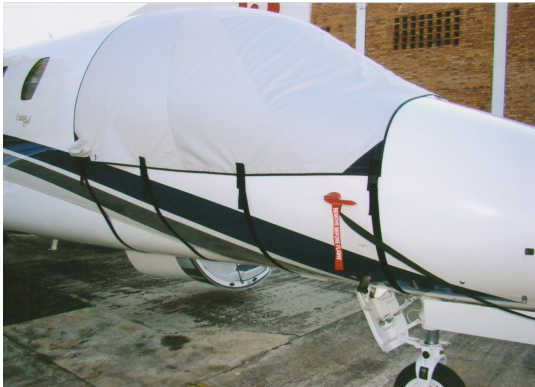
Citation XL Cockpit Cover

This cover type is made from Silver Acrylic Sunbrella canvas and is 100% lined with a soft and smooth microfiber. Bruce's Custom Covers developed this material combination especially for aircraft protection. The outer material is medium weight and treated for water resistance, UV resistance and anti-static buildup. The inner lining is a very soft and smooth microfiber to prevent scratching. The material is very reflective, and tests show that the cabin interior temperature can be reduced to near-ambient temperature on the hottest of days. It is water, ice and snow repellent, yet breathable to allow moisture to escape from between the cover and the aircraft surface.