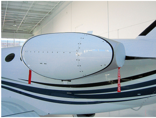
Cessna 510 Mustang Bikini Type Engine Cover