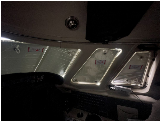
Cessna Citation 560XL Cockpit Heatshields