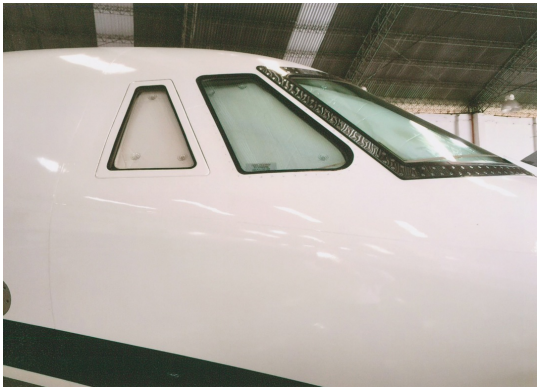
Citation XL Cockpit HeatShields

Cockpit Heatshields are interior sunshades for the aircraft's cockpit. The product is a unique composite of closed-cell foam with a silver mylar finish. The semi-rigid design is stiff enough to stand inside the window framing. The set folds up flat and is easily stored in the included storage sleeve. Some designs may require velcro and suction cups. Our Heatshields for jets are offered white side out because some aircraft manufacturers have issued advisories against reflective window inserts due to potential heat damage. A Heatshield is an excellent short-term remedy for cockpit overheating, but an external fabric cover is more effective for long-term protection.