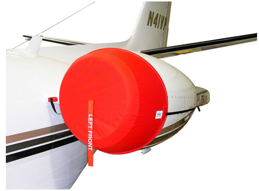
Citation Encore Intake Cover Set