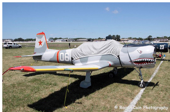
CJ-6 Nanchang Canopy Cover