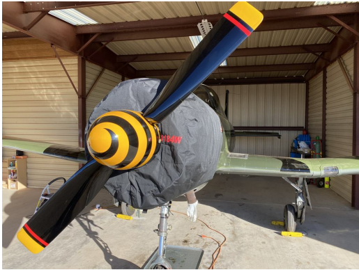
Nanchang CJ6 Insulated Engine Cover

The material is very reflective, and tests show that the cabin interior temperature can be reduced to near-ambient temperature on the hottest of days. It is water, ice and snow repellent, yet breathable to allow moisture to escape from between the cover and the aircraft surface.