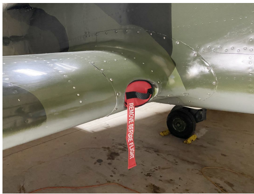
Nanchang CJ-6A Leading Edge Plug