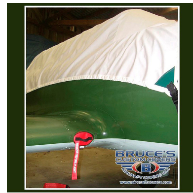
CJ6 Canopy Cover & Leading Edge Inlet Plug