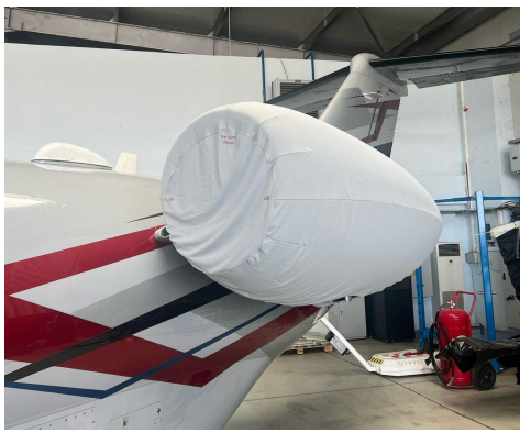
Citationjet 525C, CJ4, Complete Nacelle Cover, light weight Spandex