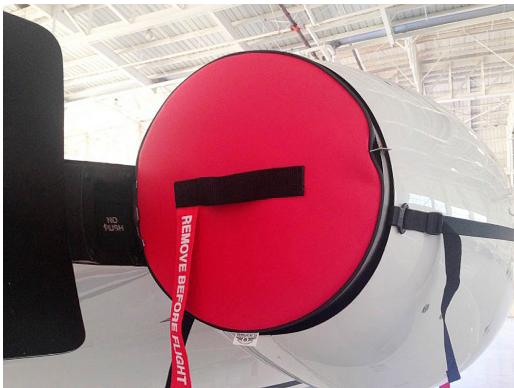
Cessna CJ1 Exhaust Plug