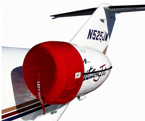
Engine Inlet Cover

The Cessna Citationjet 525B, CJ-3 Intake/Exhaust Plugs are custom fit for the intake and exhaust openings, made with heavy-duty vinyl material, and stuffed with a single block of sculpted urethane foam. Each plug has a zipper that allows the foam to be removed and dried if necessary. Engine plugs have 'remove before flight' streamers sewn onto the face of the plugs. Most plugs are imprinted with the aircraft registration number in black. Engine plugs may be inserted after flight when the engine is still warm. Engine Inlet Plugs are commonly referred to as Cowl Plugs, Intake Plugs, Cowl Blocks, Engine Blocks, and Engine Bungs.