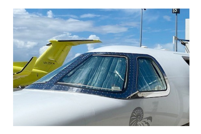
Cessna Citationjet CJ2 Cockpit HeatShields