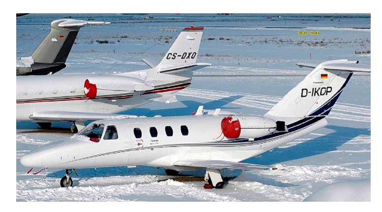
Engine Inlet Covers

The Cessna Citationjet 525A, CJ-2, & CJ2+ Intake/Exhaust Plugs are custom fit for the intake and exhaust openings, made with heavy-duty vinyl material, and stuffed with a single block of sculpted urethane foam. Each plug has a zipper that allows the foam to be removed and dried if necessary. Engine plugs have 'remove before flight' streamers sewn onto the face of the plugs. Most plugs are imprinted with the aircraft registration number in black. Engine plugs may be inserted after flight when the engine is still warm. Engine Inlet Plugs are commonly referred to as Cowl Plugs, Intake Plugs, Cowl Blocks, Engine Blocks, and Engine Bungs.