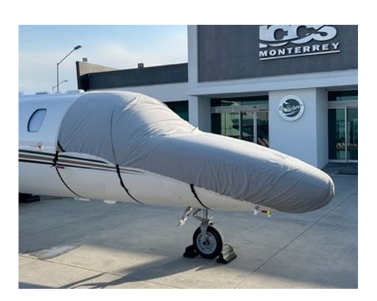
Citation CJ4 Cockpit/Nose Cover and Heat Resistant Pitot Covers set Cessna Citationjet 525B Travel Weight Cockpit/Nose Cover