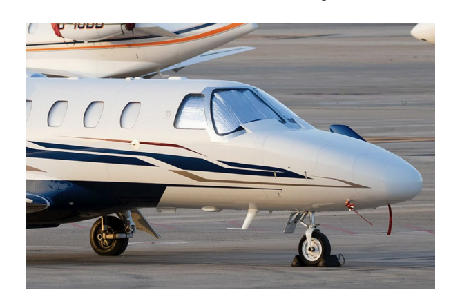
Cessna Citationjet 525, CJ-I, CJ1+, & M2 Cockpit Heatshields

Custom-made Heatshield Sunshades are available for almost any window in the jet. Side windows, Skylights, and Emergency Exits are all custom-made. The product is a unique composite of closed-cell foam with a silver mylar finish. The set is easily stored in the included storage sleeve. Some designs may require velcro and suction cups. Our Heatshields are offered white side out since aircraft manufacturers have issued advisories against reflective window inserts due to potential heat damage.