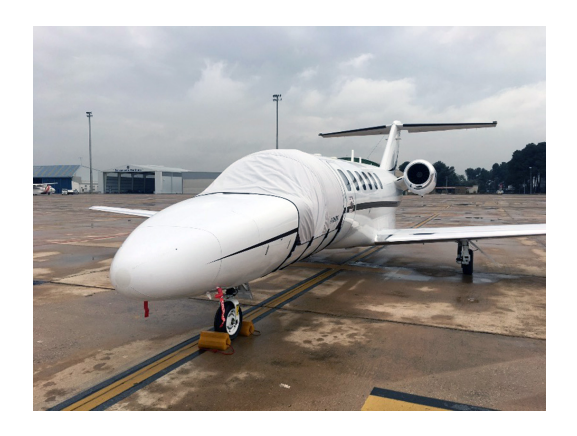
Cessna Citationjet 525A, CJ-2, & CJ2+ Cockpit Cover