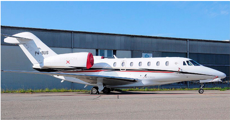
Citation X Intake & Pitot Tube Covers

The Cessna Citation X (750) Intake Covers are designed to install easily yet be completely storable. A spring steel hoop is sewn into the hem of each cover, allowing them to be installed without climbing onto the wing or using a stepladder. To store the covers the spring steel hoop folds like a band-saw blade into three nesting rings. Each cover folds into a compact circular bundle which is stored in the included duffle bag, yet they unfold quickly for use. The Tri-Fold Ring cover is made of medium weight nylon which is available in a variety of colors to match the paint trim. Each cover set comes complete with installation and folding instructions. The aircraft's registration number can be silkscreened onto the cover for an extra charge.