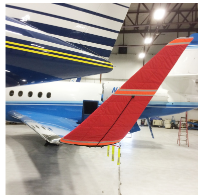
Falcon 2000 Winglet Pad