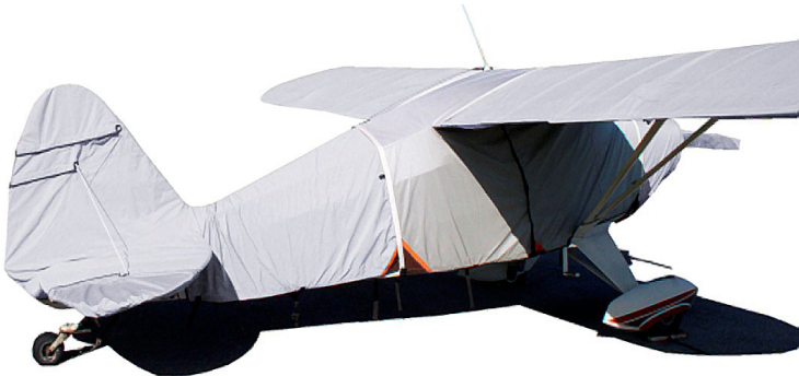
Piper Pacer Full Cover Set