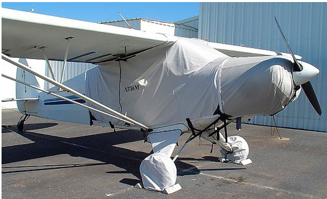
Piper PA-12 Extended Canopy, Engine & Landing Gear Covers

Insulated Covers Material - A special composite material of solution-dyed polyester, 3M Thinsulate insulation, and soft nylon interior fabric. Our insulated covers are designed to complement an engine preheater and help retain heat in the engine compartment after shutdown. If you operate your aircraft in cold-weather, these covers will help prevent engine wear and tear.