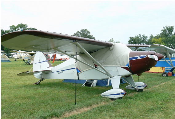
Piper Pacer Canopy Cover