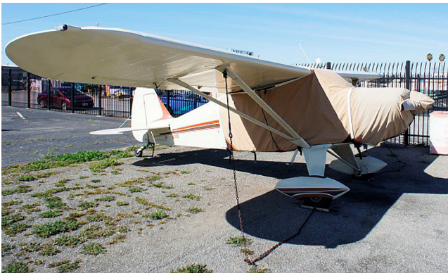
Piper PA-22-150 Pacer Extended Canopy, Engine & Prop/Spinner Covers