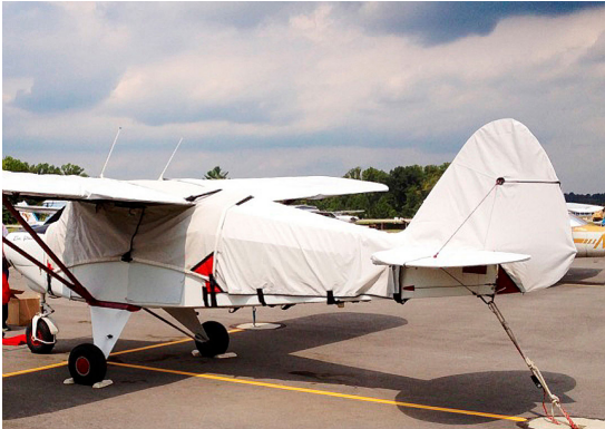
Piper Tri-Pacer Canopy, Empennage and Wing Covers

WINTER USE MATERIAL - Made with Solution-Dyed Polyester fabric, this option is intended for seasonal use to aid in deicing, rain mitigation, or for occasional travel. The material is lighter and more compact, but more susceptible to UV damage and may have a shorter useful life if used continuously outside than the all-year use material.