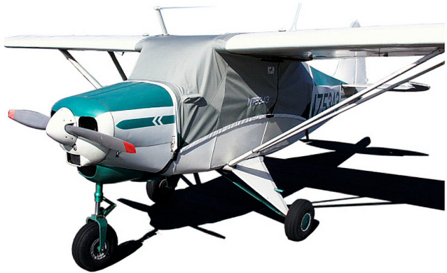
Tri-Pacer Over-the-Top Canopy Cover

lightweight and more compact for easy stowage in the aircraft. The polyester material is water resistant, but only intended for occasional use outside. We also have an ultra lightweight material available for fitted hangar dust covers. For daily outdoor use, the non-travel Sunbrella Cover is the best choice.