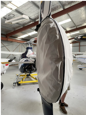
Guimbal Cabri G2 Tailfan Housing Fenestron Cover