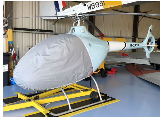
Cabri G2 Light Weight Travel Bubble Cover