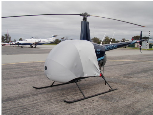
Robinson R-22 Light Weight Travel Cover

Travel Covers are made with Silver Solution-Dyed Polyester fabric and fully lined over the entire cover. The material is lightweight and more compact for easy stowage in the aircraft. The polyester material is water resistant, but only intended for occasional use outside. We also have an ultra lightweight material available for fitted hangar dust covers. For daily outdoor use, the non-travel Sunbrella Cover is the best choice.