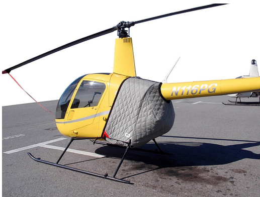
Robinson R-22 Insulated Engine Cover (also covers bottom) & Front Blade Tie-down

WINTER USE MATERIAL - Made with Solution-Dyed Polyester fabric, this option is intended for seasonal use to aid in deicing, rain mitigation, or for occasional travel. The material is lighter and more compact, but more susceptible to UV damage and may have a shorter useful life if used continuously outside than the all-year use material.