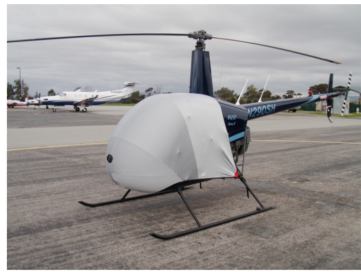
Robinson R-22 Light Weight Travel Cover