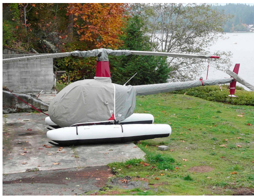
Robinson R-22 Bubble Cover (Ext. Past Rotor Hub), Engine Cover, Tailboom Cover, Blade Covers, Rotor Hub Cover, & Tail Rotor Gear Box Cover