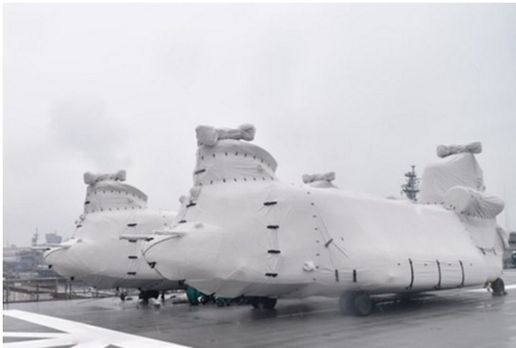
Boeing CH-47 Complete Body Cover