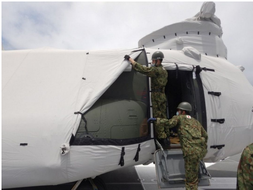
Boeing CH-47 Complete Body Cover

This cover type is made from Silver Acrylic Sunbrella canvas and is 100% lined with a soft and smooth microfiber. Bruce's Custom Covers developed this material combination especially for aircraft protection. The outer material is medium weight and treated for water resistance, UV resistance and anti-static buildup. The inner lining is a very soft and smooth microfiber to prevent scratching. The material is very reflective, and tests show that the cabin interior temperature can be reduced to near-ambient temperature on the hottest of days. It is water, ice and snow repellent, yet breathable to allow moisture to escape from between the cover and the aircraft surface.