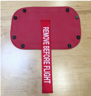
Boeing Vertol CH-47 Chinook Forward Pylon Side Inlet Snap Covers