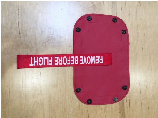
Boeing Vertol CH-47 Chinook Forward Pylon Side Inlet Snap Covers

Insulated Covers Material - A special composite material of solution-dyed polyester, 3M Thinsulate insulation, and soft nylon interior fabric. Our insulated covers are designed to complement an engine preheater and help retain heat in the engine compartment after shutdown. If you operate your aircraft in cold-weather, these covers will help prevent engine wear and tear.