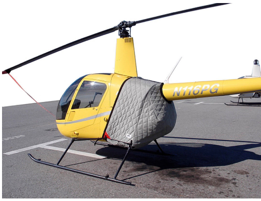
Robinson R-22 Insulated Engine Cover (also covers bottom) & Front Blade Tie-down