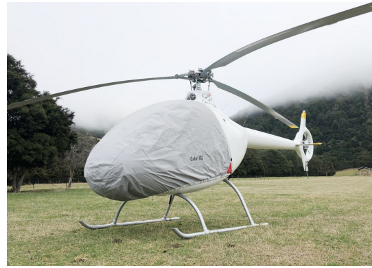
Guimbal Cabri CG2 Bubble Cover, light weight travel type