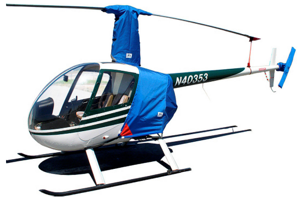
Robinson R-22 Engine, Rotor Mast & Tail Rotor Covers, with Blade Tie-down