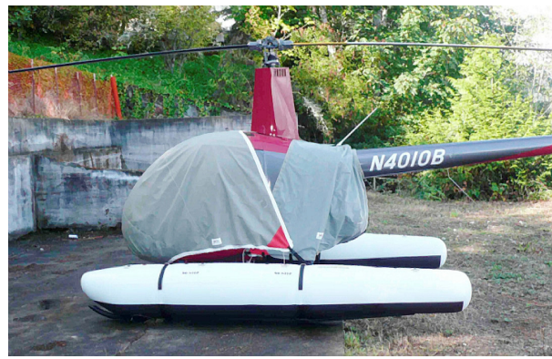
Robinson R-22 Standard Bubble Cover & Engine Cover