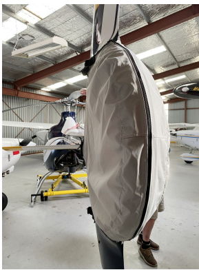
Guimbal Cabri G2 Tailfan Housing Fenestron Cover