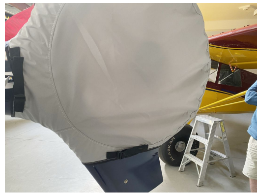
Guimbal Cabri G2 Tailfan Housing Fenestron Cover