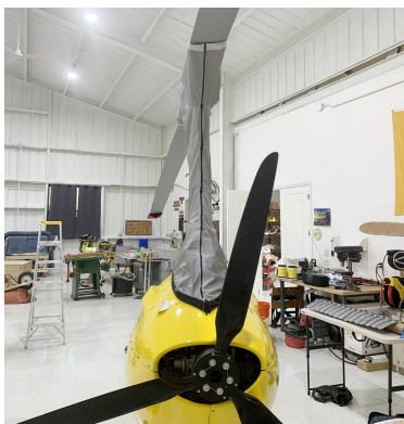
Autogyro Calidus Gyrocopter Rotor Hub/Mast Cover

Rotor Hub Covers overlaps with the Blade Covers to ensure complete protection for the entire main rotor system. Designed like a jacket with sleeves and no collar, the rotor hub cover fastens together below each blade with Delrin buckles. The Rotor Hub Cover is normally made from Solution-Dyed Polyester.