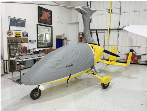
Autogyro Calidus Gyrocopter Canopy/Nose & Rotor Hub/Mast Cover Autogyro Calidus Gyrocopter Canopy/Nose & Rotor Hub/Mast Cover