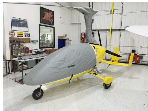
Autogyro Calidus Gyrocopter Canopy/Nose & Rotor Hub/Mast Cover