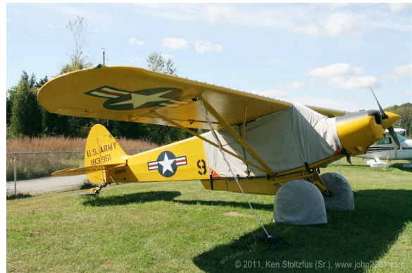
Piper L-21b Extended Canopy Cover, Tire Covers