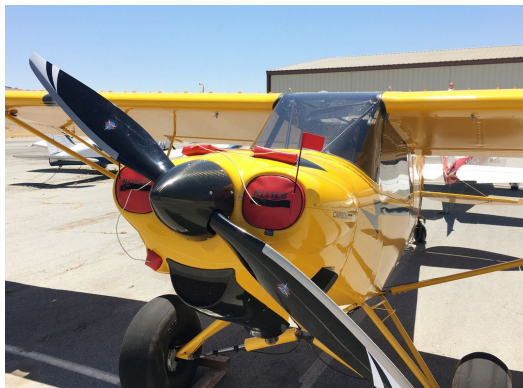
Cub Crafters CC-11 Carbon Cub Engine Plugs

Engine Inlet Plugs are custom fit for your CubCrafters CC-18, 19, 20, Top Cub, CCK-1865, CC-19 X-Cub, CCX-2000, EX-3, FX-3 intakes, made with heavy-duty vinyl material, and stuffed with a single block of sculpted urethane foam. Each plug has a zipper that allows the foam to be removed and dried if necessary. Engine plugs have warning flags that are visible from the cockpit or 'remove before flight' streamers sewn onto the face of the plugs. Most plugs are imprinted with the aircraft registration number in black for an extra charge. Storage bag NOT included. Engine plugs may be inserted after flight when the engine is still warm. Engine Inlet Plugs are commonly referred to as Cowl Plugs, Intake Plugs, Cowl Blocks, Engine Blocks, and Engine Bungs.