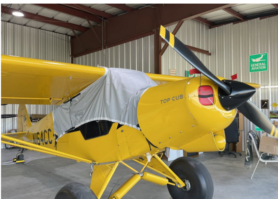
Cub Crafters CC-18 Light Weight Travel Canopy Cover, Engine Plugs

This cover type is made from Silver Acrylic Sunbrella canvas and is 100% lined with a soft and smooth microfiber. Bruce's Custom Covers developed this material combination especially for aircraft protection. The outer material is medium weight and treated for water resistance, UV resistance and anti-static buildup. The inner lining is a very soft and smooth microfiber to prevent scratching. The material is very reflective, and tests show that the cabin interior temperature can be reduced to near-ambient temperature on the hottest of days. It is water, ice and snow repellent, yet breathable to allow moisture to escape from between the cover and the aircraft surface.