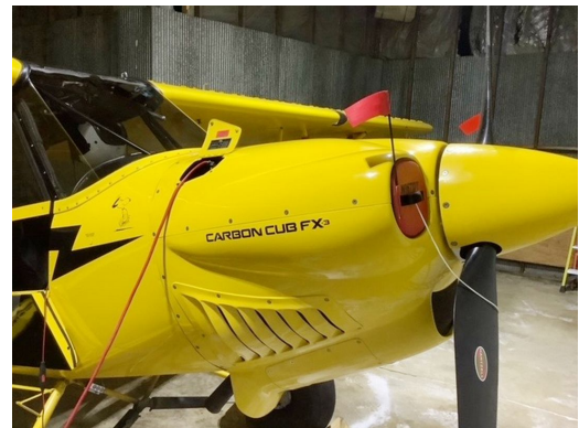
Cub Crafters CCX-2000 Engine Plugs