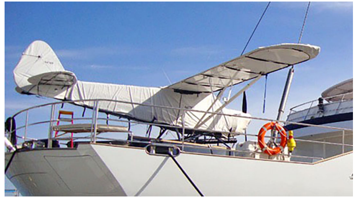
Piper PA-18 Super Cub Complete Cover set