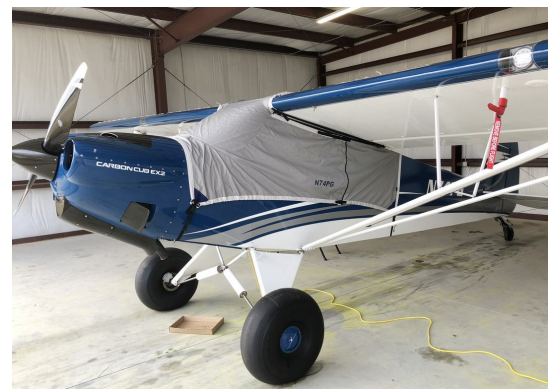
Cub Crafters Carbon Cub Travel Weight Canopy Cover