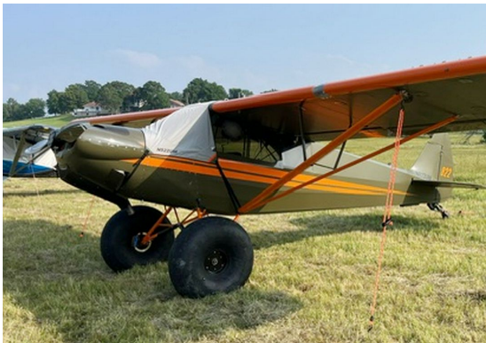
Cub Crafters CC18 Windshield/Skylight Cover

This cover type is made from Silver Acrylic Sunbrella canvas and is 100% lined with a soft and smooth microfiber. Bruce's Custom Covers developed this material combination especially for aircraft protection. The outer material is medium weight and treated for water resistance, UV resistance and anti-static buildup. The inner lining is a very soft and smooth microfiber to prevent scratching. The material is very reflective, and tests show that the cabin interior temperature can be reduced to near-ambient temperature on the hottest of days. It is water, ice and snow repellent, yet breathable to allow moisture to escape from between the cover and the aircraft surface.