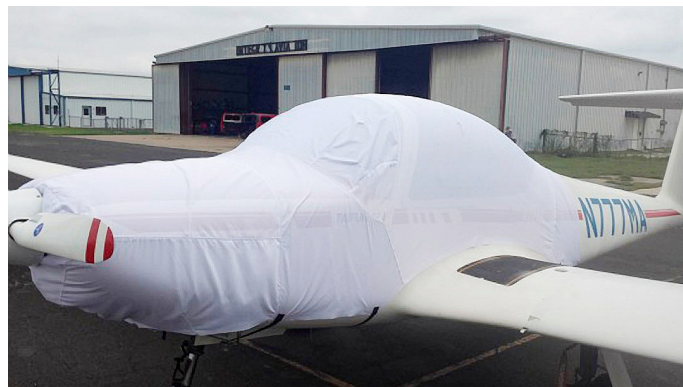
Taifun 17E Canopy/Engine Cover, test fit cover