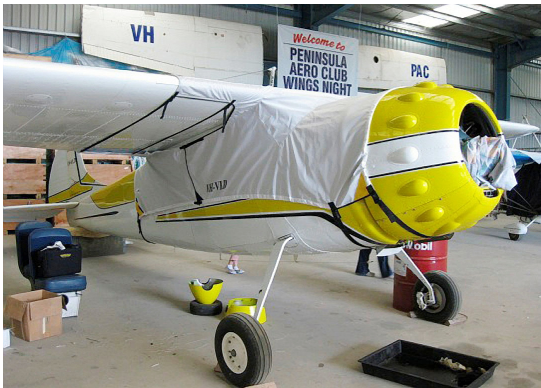
Cessna 195 Canopy Cover, over-top, 24" fwd ext to cover cowl ring gap, gas cap ext.

The material is very reflective, and tests show that the cabin interior temperature can be reduced to near-ambient temperature on the hottest of days. It is water, ice and snow repellent, yet breathable to allow moisture to escape from between the cover and the aircraft surface.