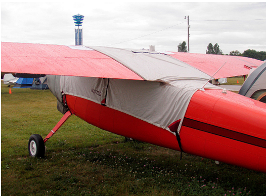
Over-Top Canopy Cover & Engine Cover