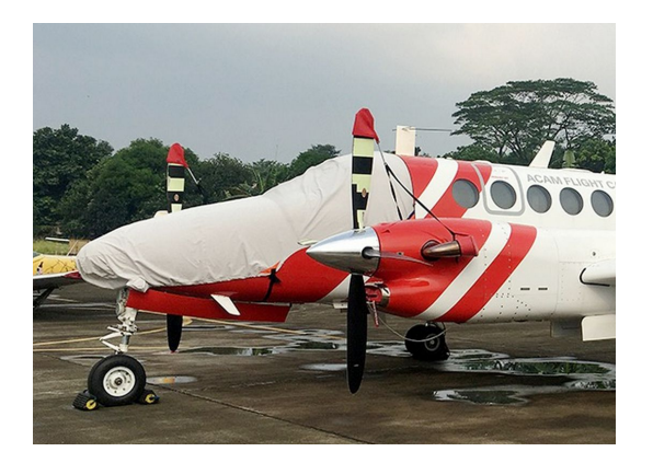
Beech King Air 200 Cockpit/Nose Cover

The material is very reflective, and tests show that the cabin interior temperature can be reduced to near-ambient temperature on the hottest of days. It is water, ice and snow repellent, yet breathable to allow moisture to escape from between the cover and the aircraft surface.