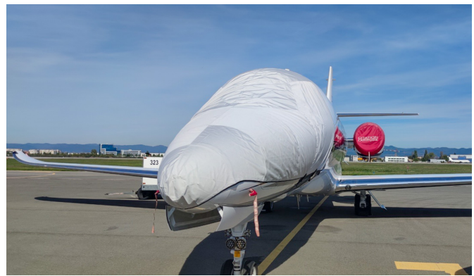
Cessna Citation Latitude (680A) Cockpit/Nose Cover, Doesn't Cover Pitot Tubes