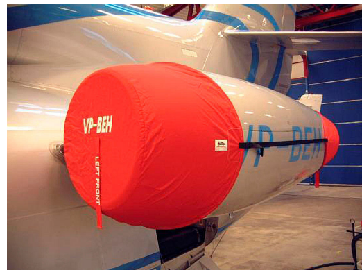
Falcon 900 Sovereign Engine Covers