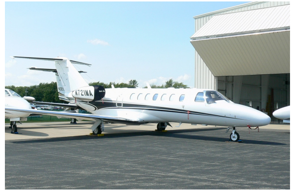
Cessna Citation CJ3 Bikini Style Engine Covers