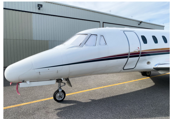
Cessna 650 Cockpit Heatshields (set of 6)