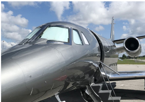
Cessna Citation 560XL Cockpit HeatShields

Cockpit Heatshields are interior sunshades for the aircraft's cockpit. The product is a unique composite of closed-cell foam with a silver mylar finish. The semi-rigid design is stiff enough to stand inside the window framing. The set folds up flat and is easily stored in the included storage sleeve. Some designs may require velcro and suction cups. Our Heatshields for jets are offered white side out because some aircraft manufacturers have issued advisories against reflective window inserts due to potential heat damage. A Heatshield is an excellent short-term remedy for cockpit overheating, but an external fabric cover is more effective for long-term protection.