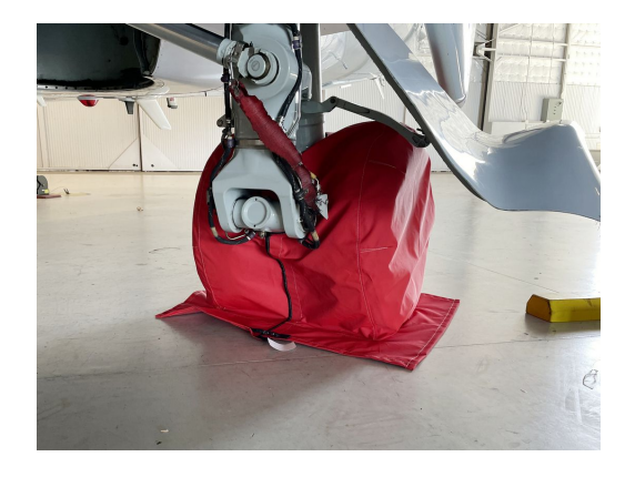
Canadair Challenger 605 Main Gear Tire Covers

ALL-YEAR USE MATERIAL - Made with Silver Acrylic Sunbrella canvas, the all-year use material is the best option for sun protection and cover longevity. This heavier more durable material is intended for all weather conditions, such as rain and snow or lots of sun.