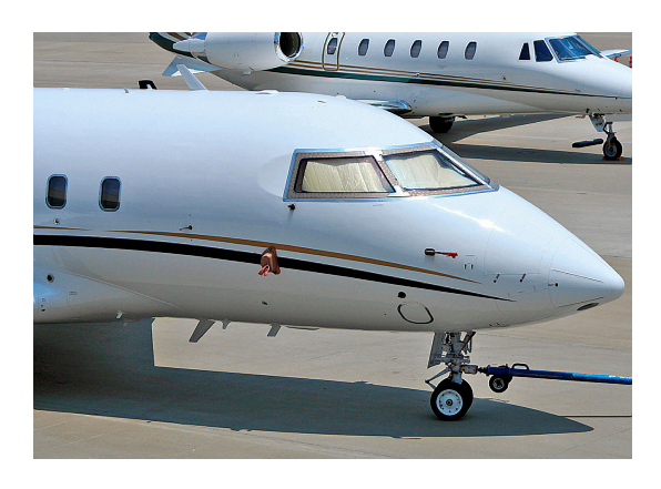
Challenger 604 Cockpit HeatShields