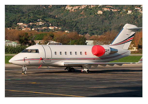
Challenger 601 Intake Covers, standard design