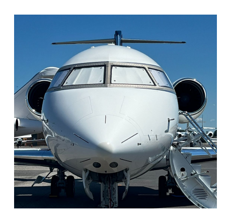
Bombardier CL-600-2B16 Cockpit Heatshields