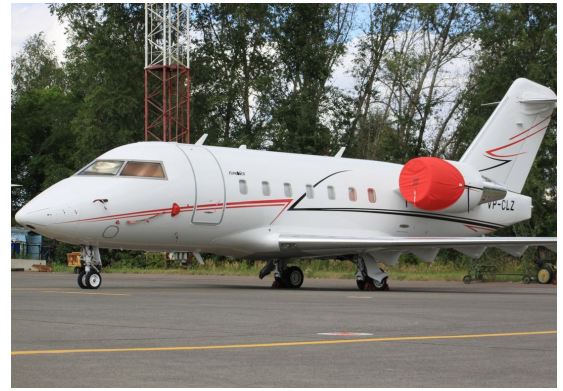
Canadair Challenger 601 Intake Covers