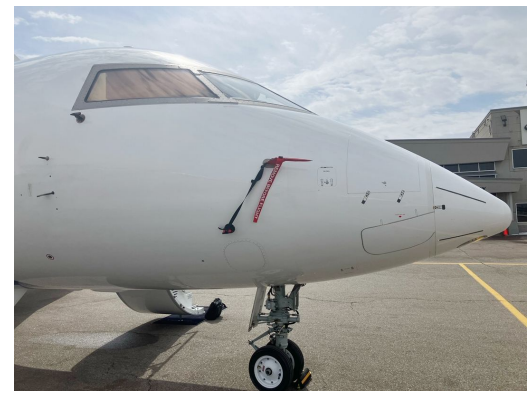
Challenger 650 Pitot & Ice Detector Covers