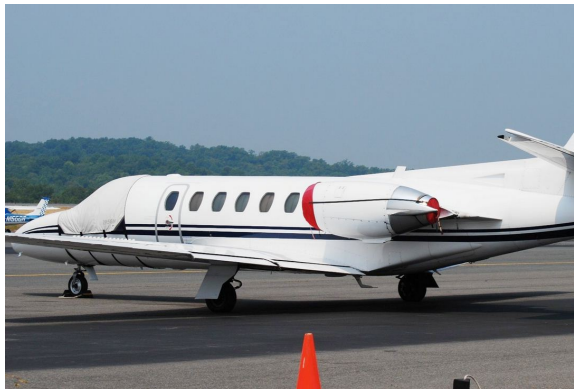
Cessna Citation S2 Cockpit Cover, Intake Covers & Exhaust Plugs

This cover type is made from Silver Acrylic Sunbrella canvas and is 100% lined with a soft and smooth microfiber. Bruce's Custom Covers developed this material combination especially for aircraft protection. The outer material is medium weight and treated for water resistance, UV resistance and anti-static buildup. The inner lining is a very soft and smooth microfiber to prevent scratching. The material is very reflective, and tests show that the cabin interior temperature can be reduced to near-ambient temperature on the hottest of days. It is water, ice and snow repellent, yet breathable to allow moisture to escape from between the cover and the aircraft surface.