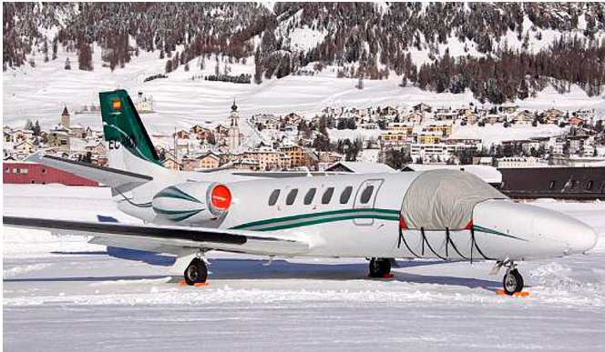
Cessna Citation 550 Windshield Cover

This cover type is made from Silver Acrylic Sunbrella canvas and is 100% lined with a soft and smooth microfiber. Bruce's Custom Covers developed this material combination especially for aircraft protection. The outer material is medium weight and treated for water resistance, UV resistance and anti-static buildup. The inner lining is a very soft and smooth microfiber to prevent scratching. The material is very reflective, and tests show that the cabin interior temperature can be reduced to near-ambient temperature on the hottest of days. It is water, ice and snow repellent, yet breathable to allow moisture to escape from between the cover and the aircraft surface.