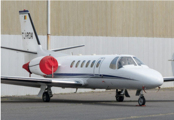
Cessna Citation II Bravo Engine Covers

The Cessna Citationjet V Ultra & Encore Models Intake/Exhaust Plugs are custom fit for the intake and exhaust openings, made with heavy-duty vinyl material, and stuffed with a single block of sculpted urethane foam. Each plug has a zipper that allows the foam to be removed and dried if necessary. Engine plugs have 'remove before flight' streamers sewn onto the face of the plugs. Most plugs are imprinted with the aircraft registration number in black. Engine plugs may be inserted after flight when the engine is still warm. Engine Inlet Plugs are commonly referred to as Cowl Plugs, Intake Plugs, Cowl Blocks, Engine Blocks, and Engine Bunges.