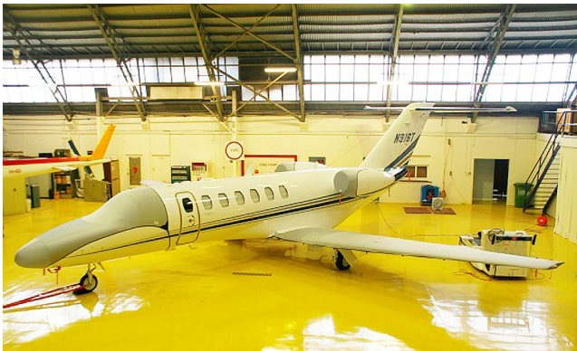
Cessna Citationjet CJ3 Cockpit/Nose, Engine & Wings Travel Covers