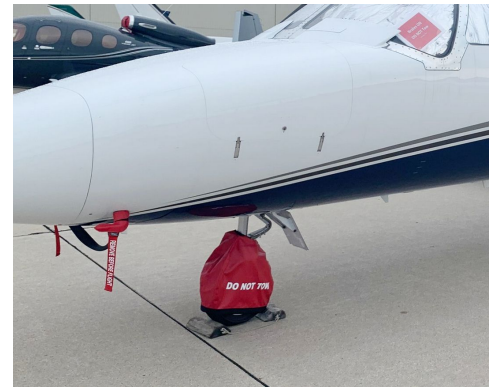
Cessna Citation Nose Tire Cover