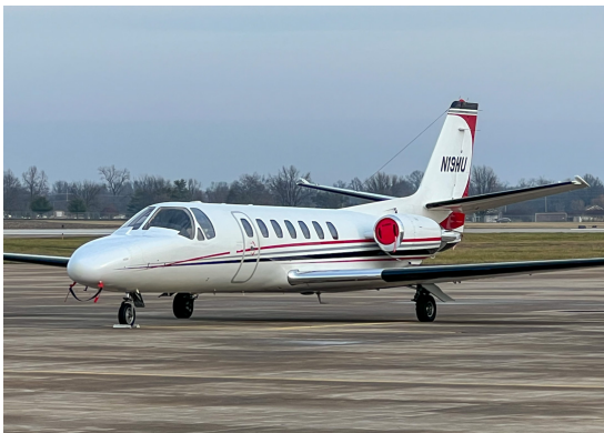
Citationjet V Ultra (560) Exhaust Plugs (set of 2)