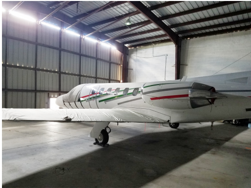
Cessna Citation II Cockpit Cover, Wing Covers