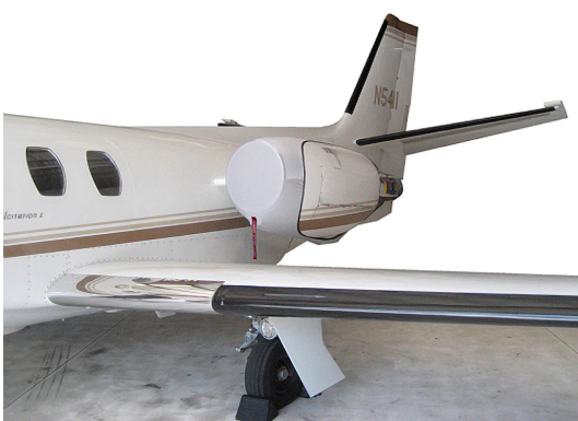
Cessna Citation "Bikini" Type Engine Covers: Extremely Light & Portable