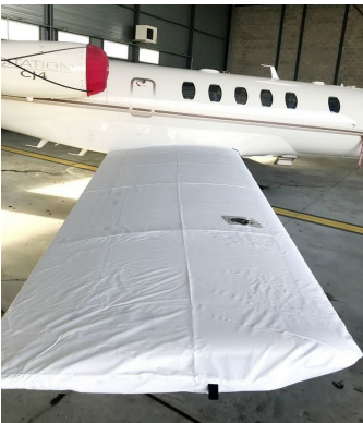
Cessna Citation CJ-4 Wing Covers, test fit cover

WINTER USE MATERIAL - Made with Solution-Dyed Polyester fabric, this option is intended for seasonal use to aid in deicing, rain mitigation, or for occasional travel. The material is lighter and more compact, but more susceptible to UV damage and may have a shorter useful life if used continuously outside than the all-year use material.