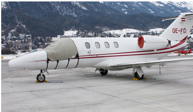
Cessna Citationjet CJ1 Cockpit Cover

This cover type is made from Silver Acrylic Sunbrella canvas and is 100% lined with a soft and smooth microfiber. Bruce's Custom Covers developed this material combination especially for aircraft protection. The outer material is medium weight and treated for water resistance, UV resistance and anti-static buildup. The inner lining is a very soft and smooth microfiber to prevent scratching. The material is very reflective, and tests show that the cabin interior temperature can be reduced to near-ambient temperature on the hottest of days. It is water, ice and snow repellent, yet breathable to allow moisture to escape from between the cover and the aircraft surface.