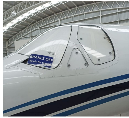
Cessna Citation I & II Cockpit HeatShields