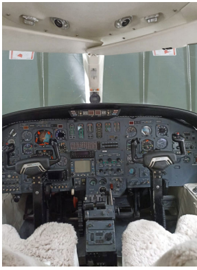
Cessna Citation I & II Cockpit HeatShields