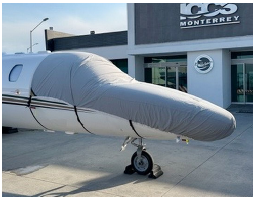
Cessna Citationjet 525B Travel Weight Cockpit/Nose Cover