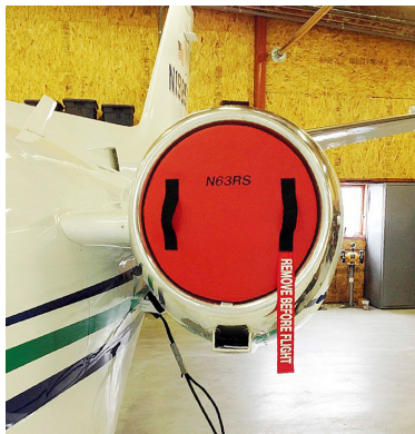
Cessna Citation S2 Intake Plugs

The Engine Inlet Plugs are custom fit for your Cessna Citationjet V Ultra & Encore Models intakes, made with heavy-duty vinyl material, and stuffed with a single block of sculpted urethane foam. Each plug has a zipper that allows the foam to be removed and dried if necessary. Engine plugs have 'remove before flight' streamers sewn onto the face of the plugs. Most plugs are imprinted with the aircraft registration number in black for an extra charge. Storage bag NOT included. Engine plugs may be inserted after flight when the engine is still warm. Engine Inlet Plugs are commonly referred to as Cowl Plugs, Intake Plugs, Cowl Blocks, Engine Blocks, and Engine Bungs.