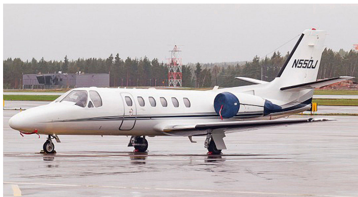
Cessna Citation Bravo Engine Covers and Pitot Covers sets

The Cessna Citation II (550, 551, UC-35A, with JT15D) Intake Covers are designed to install easily yet be completely storable. A spring steel hoop is sewn into the hem of each cover, allowing them to be installed without climbing onto the wing or using a stepladder. To store the covers the spring steel hoop folds like a band-saw blade into three nesting rings. Each cover folds into a compact circular bundle which is stored in the included duffle bag, yet they unfold quickly for use. The Tri-Fold Ring cover is made of medium weight nylon which is available in a variety of colors to match the paint trim. Each cover set comes complete with installation and folding instructions. The aircraft's registration number can be silkscreened onto the cover for an extra charge.