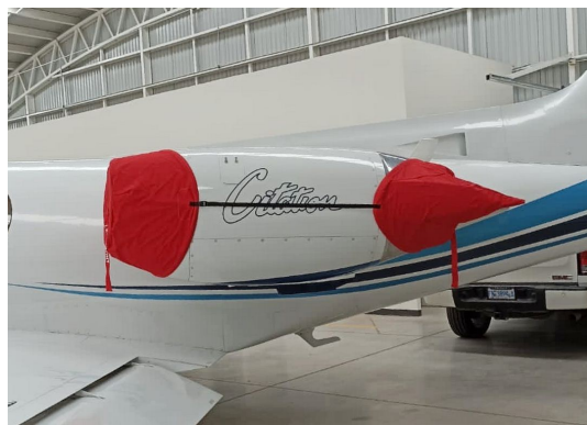
Cessna 551 Citation II SP Engine covers (with thrust reversers, smooth gen. inlet)