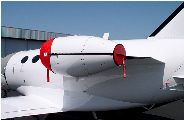
Citation Mustang Intake Cover/Exhaust Plug Set