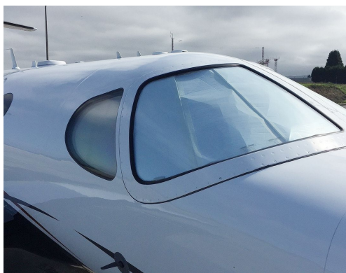
Cessna Mustang 510 Cockpit Heatshields