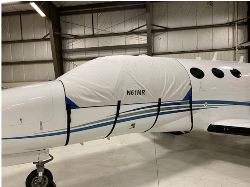
Cessna 510 Cockpit Cover extends to cover door

This cover type is made from Silver Acrylic Sunbrella canvas and is 100% lined with a soft and smooth microfiber. Bruce's Custom Covers developed this material combination especially for aircraft protection. The outer material is medium weight and treated for water resistance, UV resistance and anti-static buildup. The inner lining is a very soft and smooth microfiber to prevent scratching. The material is very reflective, and tests show that the cabin interior temperature can be reduced to near-ambient temperature on the hottest of days. It is water, ice and snow repellent, yet breathable to allow moisture to escape from between the cover and the aircraft surface.