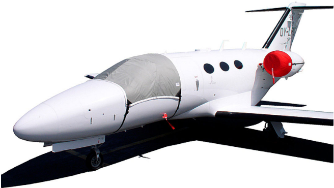
Citation Mustang Windshield Cover, Intake Cover/Exhaust Plug Set, Pitot Covers

The Cessna Mustang 510 Intake/Exhaust Plugs are custom fit for the intake and exhaust openings, made with heavy-duty vinyl material, and stuffed with a single block of sculpted urethane foam. Each plug has a zipper that allows the foam to be removed and dried if necessary. Engine plugs have 'remove before flight' streamers sewn onto the face of the plugs. Most plugs are imprinted with the aircraft registration number in black. Engine plugs may be inserted after flight when the engine is still warm. Engine Inlet Plugs are commonly referred to as Cowl Plugs, Intake Plugs, Cowl Blocks, Engine Blocks, and Engine Bungs.