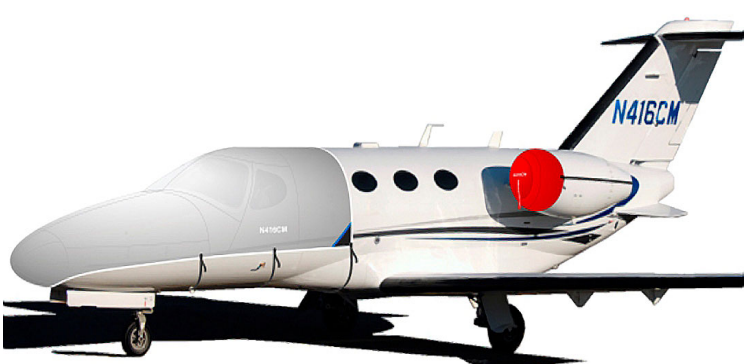
Citation Mustang Cockpit/Door/Nose Cover, Engine Inlet Cover