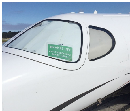
Cessna Mustang 510 Cockpit Heatshields