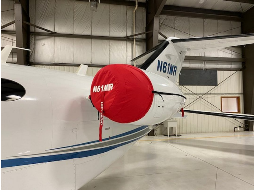
Cessna 510 Engine Inlet Covers & Exhaust Plugs