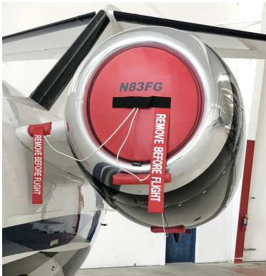
Cessna Mustang 510 Engine Inlet Plugs, Includes Intercooler Intake & Exhaust And Gen. Plugs

The Engine Inlet Plugs are custom fit for your Cessna Mustang 510 intakes, made with heavy-duty vinyl material, and stuffed with a single block of sculpted urethane foam. Each plug has a zipper that allows the foam to be removed and dried if necessary. Engine plugs have 'remove before flight' streamers sewn onto the face of the plugs. Most plugs are imprinted with the aircraft registration number in black for an extra charge. Storage bag NOT included. Engine plugs may be inserted after flight when the engine is still warm. Engine Inlet Plugs are commonly referred to as Cowl Plugs, Intake Plugs, Cowl Blocks, Engine Blocks, and Engine Bungs.