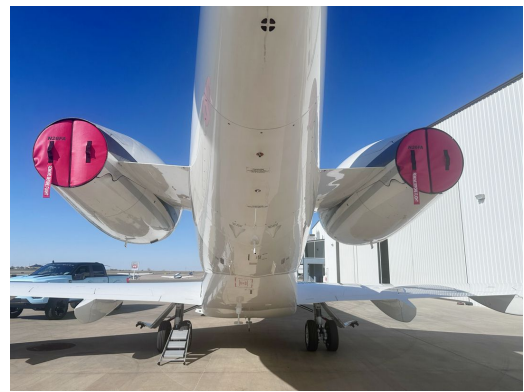
Canadair Challenger 300 Exhaust Plugs