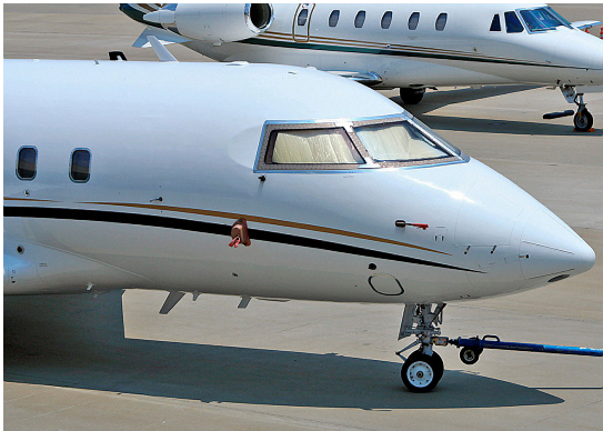
Challenger 604 Cockpit HeatShields