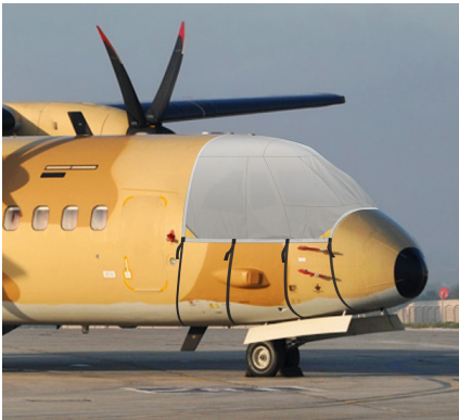
Casa C-295 Cockpit Cover (illustration)

This cover type is made from Silver Acrylic Sunbrella canvas and is 100% lined with a soft and smooth microfiber. Bruce's Custom Covers developed this material combination especially for aircraft protection. The outer material is medium weight and treated for water resistance, UV resistance and anti-static buildup. The inner lining is a very soft and smooth microfiber to prevent scratching. The material is very reflective, and tests show that the cabin interior temperature can be reduced to near-ambient temperature on the hottest of days. It is water, ice and snow repellent, yet breathable to allow moisture to escape from between the cover and the aircraft surface.