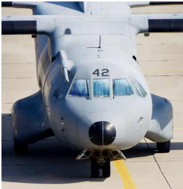
Casa C-295 Cockpit HeatShields (illustration)

for cockpit overheating, but an external fabric cover is more effective for long-term protection.