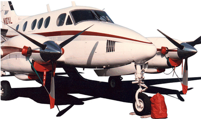
Pitot, Exhaust Covers, Engine Plugs & Prop Ties

Engine Inlet Plugs are custom fit for your Casa EADS C-295 intakes, made with heavy-duty vinyl material, and stuffed with a single block of sculpted urethane foam. Each plug has a zipper that allows the foam to be removed and dried if necessary. Engine plugs have warning flags that are visible from the cockpit or 'remove before flight' streamers sewn onto the face of the plugs. Most plugs are imprinted with the aircraft registration number in black for an extra charge. Storage bag NOT included. Engine plugs may be inserted after flight when the engine is still warm. Engine Inlet Plugs are commonly referred to as Cowl Plugs, Intake Plugs, Cowl Blocks, Engine Blocks, and Engine Bungs.