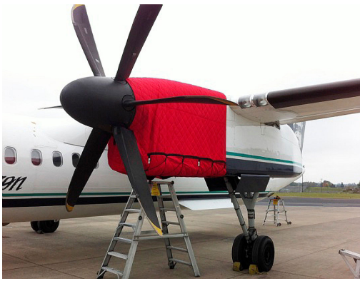
Dash 8-Q400 Insulated Engine Cover