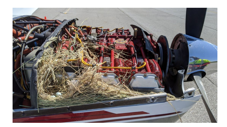
Beech Musketeer Engine Inlet Plugs