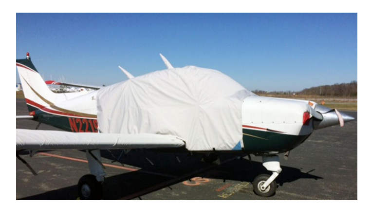
Beech Sundowner Extended Canopy Cover, Belly Strap Type

WINTER USE MATERIAL - Made with Solution-Dyed Polyester fabric, this option is intended for seasonal use to aid in deicing, rain mitigation, or for occasional travel. The material is lighter and more compact, but more susceptible to UV damage and may have a shorter useful life if used continuously outside than the all-year use material.