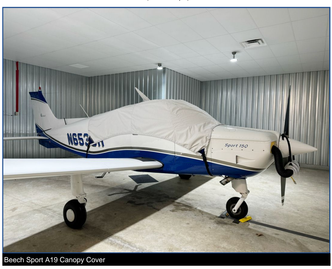
Section 1: Canopy/Cockpit/Fuselage Covers

Canopy Covers help reduce damage to your airplane's upholstery and avionics caused by excessive heat, and they can eliminate problems caused by leaking door and window seals. They keep the windshield and window surfaces clean and help prevent vandalism and theft.