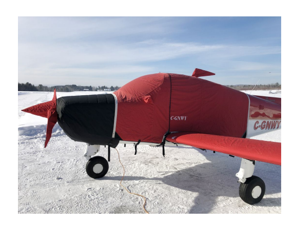
Beech Sundowner Extended Canopy, Wing, Engine & Prop Covers