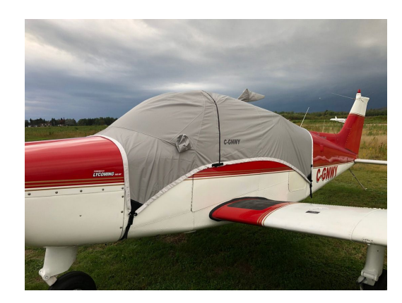
Beech Sundowner Travel Canopy Cover

Travel Covers are made with Silver Solution-Dyed Polyester fabric and only lined over the windshield to save weight. The material is lightweight and more compact for easy stowage in the aircraft. The polyester material is water resistant, but only intended for occasional use outside. We also have an ultra lightweight material available for fitted hangar dust covers. For daily outdoor use, the non-travel Sunbrella Cover is the best choice.