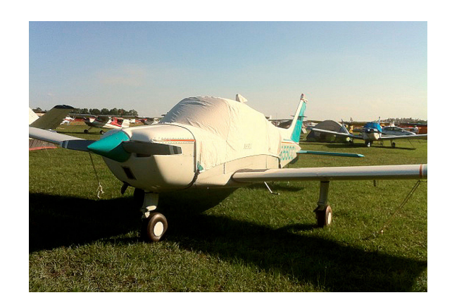
Beech C23 Sundowner Canopy Cover