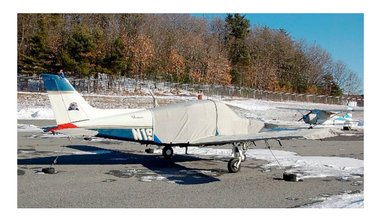
Beech Sierra Prop, Engine, Extended Canopy, Wing, Tailcone, and Horizontal Stab Covers.

This cover type is made from Silver Acrylic Sunbrella canvas and is 100% lined with a soft and smooth microfiber. Bruce's Custom Covers developed this material combination especially for aircraft protection. The outer material is medium weight and treated for water resistance, UV resistance and anti-static buildup. The inner lining is a very soft and smooth microfiber to prevent scratching. The material is very reflective, and tests show that the cabin interior temperature can be reduced to near-ambient temperature on the hottest of days. It is water, ice and snow repellent, yet breathable to allow moisture to escape from between the cover and the aircraft surface.