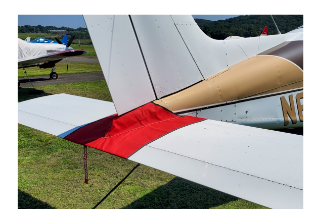
Beech Sundowner C23 Tailcone Cover, Fully Enclosed