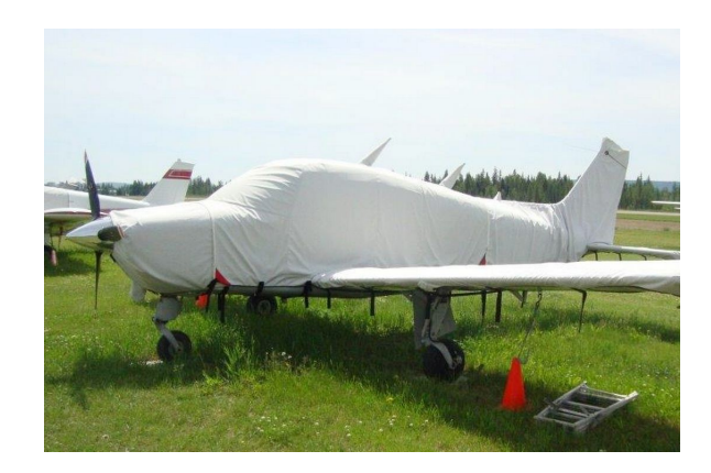
Beech Sierra Engine, Extended Canopy, Empennage, & Wing Covers

This cover type is made from Silver Acrylic Sunbrella canvas and is 100% lined with a soft and smooth microfiber. Bruce's Custom Covers developed this material combination especially for aircraft protection. The outer material is medium weight and treated for water resistance, UV resistance and anti-static buildup. The inner lining is a very soft and smooth microfiber to prevent scratching. The material is very reflective, and tests show that the cabin interior temperature can be reduced to near-ambient temperature on the hottest of days. It is water, ice and snow repellent, yet breathable to allow moisture to escape from between the cover and the aircraft surface.