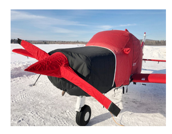
Beech Sundowner Extended Canopy, Wing, Engine & Prop Covers