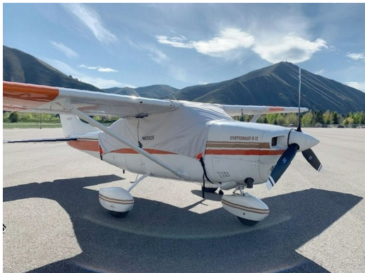
Cessna 206 Canopy Cover, Over-Top Style

This cover type is made from Silver Acrylic Sunbrella canvas and is 100% lined with a soft and smooth microfiber. Bruce's Custom Covers developed this material combination especially for aircraft protection. The outer material is medium weight and treated for water resistance, UV resistance and anti-static buildup. The inner lining is a very soft and smooth microfiber to prevent scratching. The material is very reflective, and tests show that the cabin interior temperature can be reduced to near-ambient temperature on the hottest of days. It is water, ice and snow repellent, yet breathable to allow moisture to escape from between the cover and the aircraft surface.