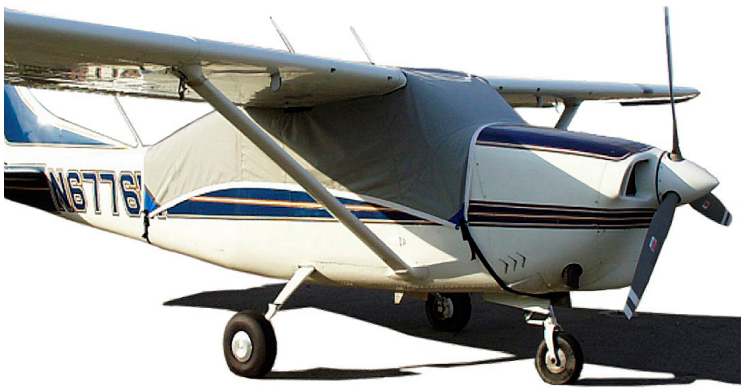
Canopy covers are available in belly strap, snap-on or Over-the-Top Styles