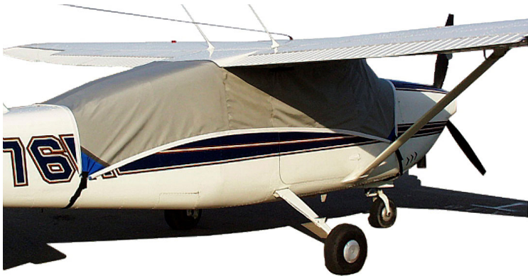
Cessna 206 Wrap-Around Canopy Cover