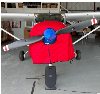
Insulated Hangar Blanket on Cessna 182

This cover type is made from Silver Acrylic Sunbrella canvas and is 100% lined with a soft and smooth microfiber. Bruce's Custom Covers developed this material combination especially for aircraft protection. The outer material is medium weight and treated for water resistance, UV resistance and anti-static buildup. The inner lining is a very soft and smooth microfiber to prevent scratching. The material is very reflective, and tests show that the cabin interior temperature can be reduced to near-ambient temperature on the hottest of days. It is water, ice and snow repellent, yet breathable to allow moisture to escape from between the cover and the aircraft surface.