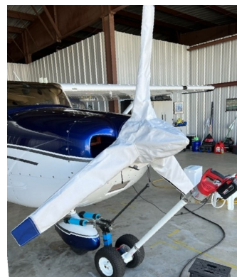
Cessna 182 Skylane 3-Blade Prop Cover