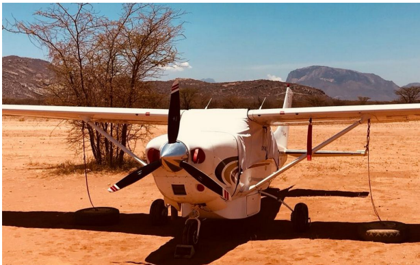
Cessna 206 Canopy Cover