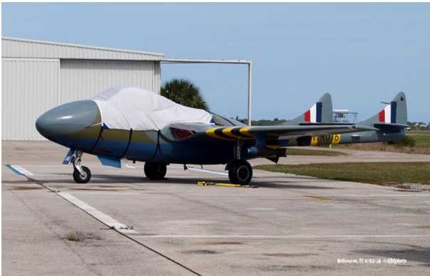
DeHavilland Vampire Canopy Cover