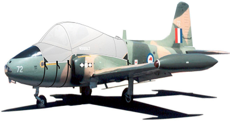
Jet Provost Canopy Cover (Illustration)

This cover type is made from Silver Acrylic Sunbrella canvas and is 100% lined with a soft and smooth microfiber. Bruce's Custom Covers developed this material combination especially for aircraft protection. The outer material is medium weight and treated for water resistance, UV resistance and anti-static buildup. The inner lining is a very soft and smooth microfiber to prevent scratching. The material is very reflective, and tests show that the cabin interior temperature can be reduced to near-ambient temperature on the hottest of days. It is water, ice and snow repellent, yet breathable to allow moisture to escape from between the cover and the aircraft surface.