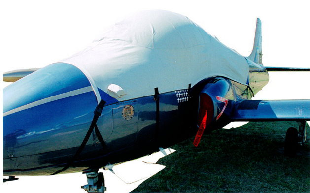
Covers & Plugs for the Jet Provost

Travel Covers are made with Silver Solution-Dyed Polyester fabric and only lined over the windshield to save weight. The material is lightweight and more compact for easy stowage in the aircraft. The polyester material is water resistant, but only intended for occasional use outside. We also have an ultra lightweight material available for fitted hangar dust covers. For daily outdoor use, the non-travel Sunbrella Cover is the best choice.