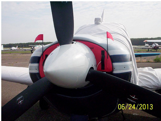
Bellanca Viking Engine Inlte Plugs