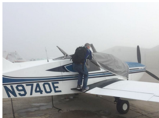
Bellanca Viking Travel Cover