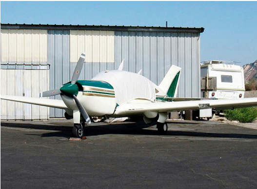
Bellanca Cruisemaster Extended Canopy Cover with 36" Wing Extensions.