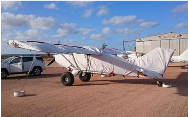
Maule M7-235 Extended Canopy, Wing, Engine & Empennage Covers