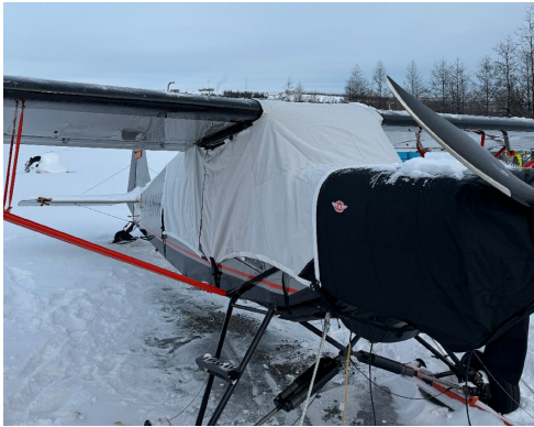
Bushmaster Canopy & Insulated Engine Covers

This cover type is made from Silver Acrylic Sunbrella canvas and is 100% lined with a soft and smooth microfiber. Bruce's Custom Covers developed this material combination especially for aircraft protection. The outer material is medium weight and treated for water resistance, UV resistance and anti-static buildup. The inner lining is a very soft and smooth microfiber to prevent scratching. The material is very reflective, and tests show that the cabin interior temperature can be reduced to near-ambient temperature on the hottest of days. It is water, ice and snow repellent, yet breathable to allow moisture to escape from between the cover and the aircraft surface.