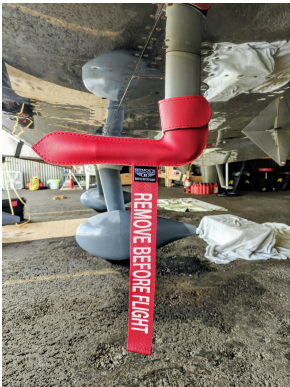
Van's RV-14 Pitot Cover

Engine Inlet Plugs are custom fit for your Bushmaster Bushmaster 4-Place intakes, made with heavy-duty vinyl material, and stuffed with a single block of sculpted urethane foam. Each plug has a zipper that allows the foam to be removed and dried if necessary. Engine plugs have warning flags that are visible from the cockpit or 'remove before flight' streamers sewn onto the face of the plugs. Most plugs are imprinted with the aircraft registration number in black for an extra charge. Storage bag NOT included. Engine plugs may be inserted after flight when the engine is still warm. Engine Inlet Plugs are commonly referred to as Cowl Plugs, Intake Plugs, Cowl Blocks, Engine Blocks, and Engine Bungs.