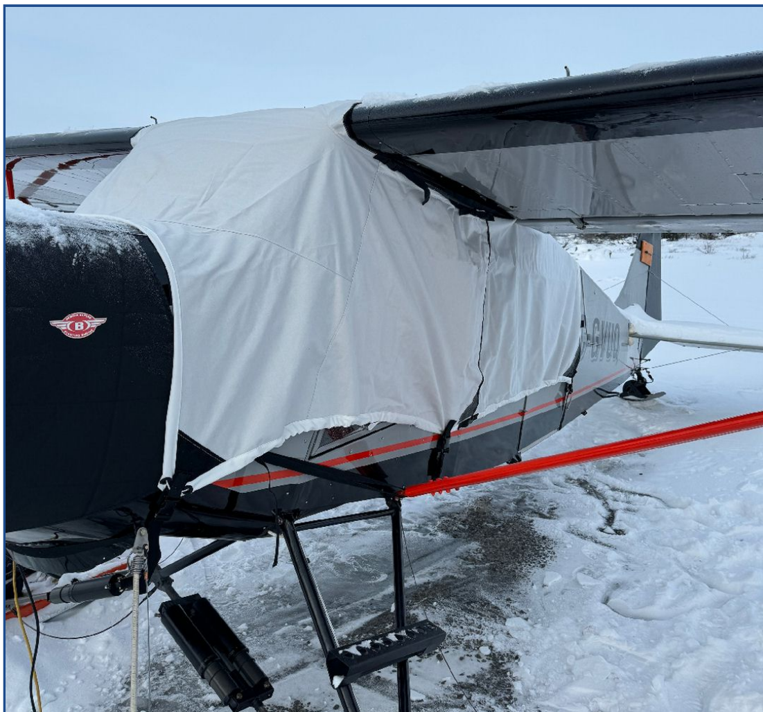
Bushmaster Canopy &amp; Insulated Engine Covers