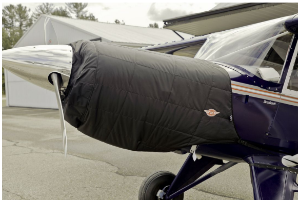
Bearhawk Insulated Engine Cover