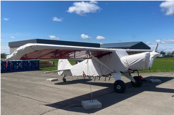
Bearhawk 4-Place Complete Cover Set, AFTER

WINTER USE MATERIAL - Made with Solution-Dyed Polyester fabric, this option is intended for seasonal use to aid in deicing, rain mitigation, or for occasional travel. The material is lighter and more compact, but more susceptible to UV damage and may have a shorter useful life if used continuously outside than the all-year use material.