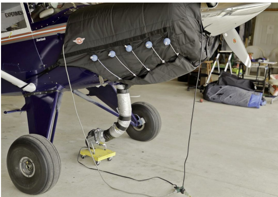
Bearhawk Insulated Engine Cover

This cover type is made from Silver Acrylic Sunbrella canvas and is 100% lined with a soft and smooth microfiber. Bruce's Custom Covers developed this material combination especially for aircraft protection. The outer material is medium weight and treated for water resistance, UV resistance and anti-static buildup. The inner lining is a very soft and smooth microfiber to prevent scratching. The material is very reflective, and tests show that the cabin interior temperature can be reduced to near-ambient temperature on the hottest of days. It is water, ice and snow repellent, yet breathable to allow moisture to escape from between the cover and the aircraft surface.