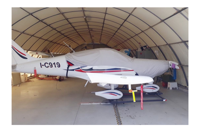
BRM Aero Bristell S-LSA Canopy/Engine Cover

This cover type is made from Silver Acrylic Sunbrella canvas and is 100% lined with a soft and smooth microfiber. Bruce's Custom Covers developed this material combination especially for aircraft protection. The outer material is medium weight and treated for water resistance, UV resistance and anti-static buildup. The inner lining is a very soft and smooth microfiber to prevent scratching. The material is very reflective, and tests show that the cabin interior temperature can be reduced to near-ambient temperature on the hottest of days. It is water, ice and snow repellent, yet breathable to allow moisture to escape from between the cover and the aircraft surface.