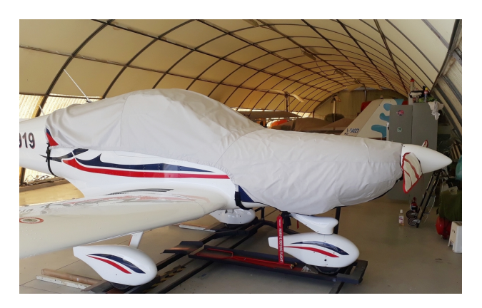
BRM Aero Bristell S-LSA Canopy/Engine Cover