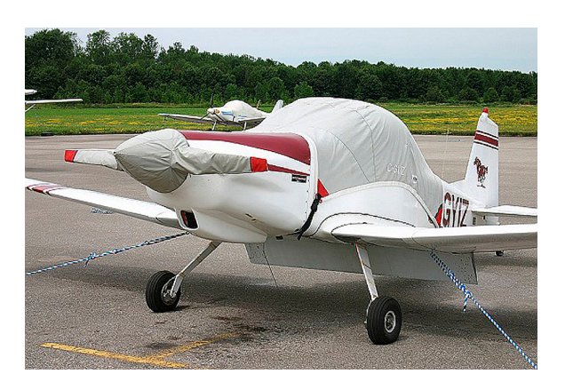
Bushby Mustang Canopy cover and Propellor/Spinner cover