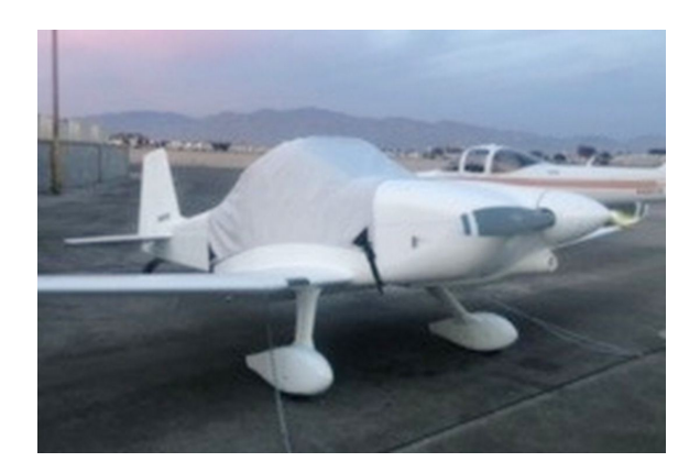
Thorp T-18 Canopy Cover

This cover type is made from Silver Acrylic Sunbrella canvas and is 100% lined with a soft and smooth microfiber. Bruce's Custom Covers developed this material combination especially for aircraft protection. The outer material is medium weight and treated for water resistance, UV resistance and anti-static buildup. The inner lining is a very soft and smooth microfiber to prevent scratching. The material is very reflective, and tests show that the cabin interior temperature can be reduced to near-ambient temperature on the hottest of days. It is water, ice and snow repellent, yet breathable to allow moisture to escape from between the cover and the aircraft surface.