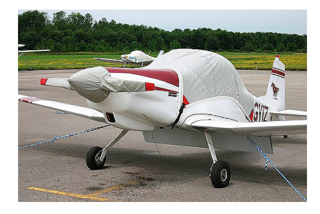
Bushby Mustang Canopy cover and Propellor/Spinner cover