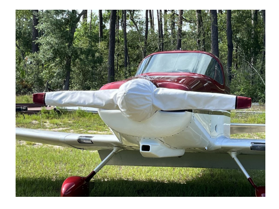
Mustang 2 Prop/Spinner Cover

This cover type is made from Silver Acrylic Sunbrella canvas and is 100% lined with a soft and smooth microfiber. Bruce's Custom Covers developed this material combination especially for aircraft protection. The outer material is medium weight and treated for water resistance, UV resistance and anti-static buildup. The inner lining is a very soft and smooth microfiber to prevent scratching. The material is very reflective, and tests show that the cabin interior temperature can be reduced to near-ambient temperature on the hottest of days. It is water, ice and snow repellent, yet breathable to allow moisture to escape from between the cover and the aircraft surface.