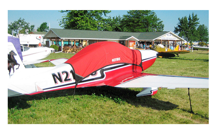
Bushby Mustang Canopy Cover