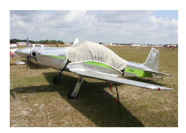
Bushby Mustang Canopy Cover

Travel Covers are made with Silver Solution-Dyed Polyester fabric and only lined over the windshield to save weight. The material is lightweight and more compact for easy stowage in the aircraft. The polyester material is water resistant, but only intended for occasional use outside. We also have an ultra lightweight material available for fitted hangar dust covers. For daily outdoor use, the non-travel Sunbrella Cover is the best choice.