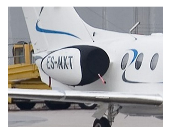
Nextant 400XTi Bikini Type Engine Covers