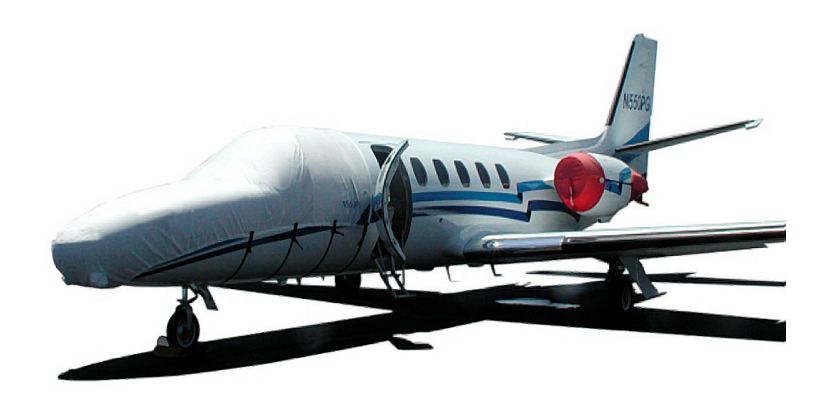
Cessna Citation Nose/Cockpit Cover, Engine Covers