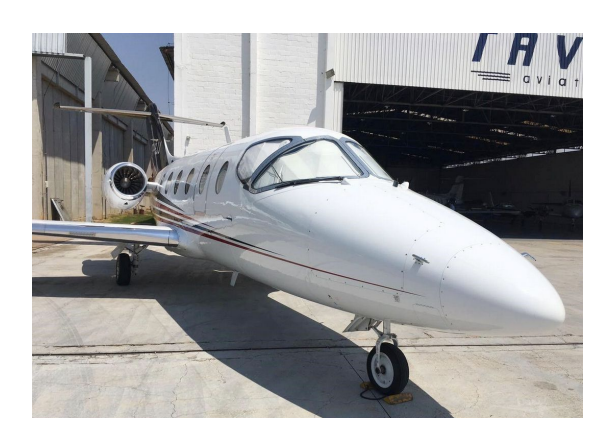
Beechjet Cockpit Heatshields

Cockpit Heatshields are interior sunshades for the aircraft's cockpit. The product is a unique composite of closed-cell foam with a silver mylar finish. The semi-rigid design is stiff enough to stand inside the window framing. The set folds up flat and is easily stored in the included storage sleeve. Some designs may require velcro and suction cups. Our Heatshields for jets are offered white side out because some aircraft manufacturers have issued advisories against reflective window inserts due to potential heat damage. A Heatshield is an excellent short-term remedy for cockpit overheating, but an external fabric cover is more effective for long-term protection.