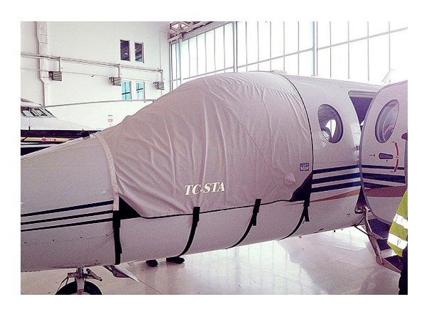
Beechjet 400A Cockpit Cover