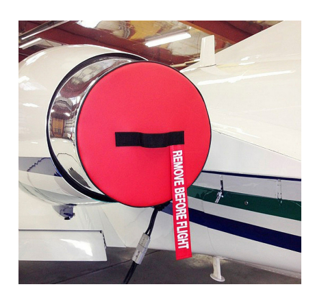
Cessna Citation S2 Exhaust Plugs

The Engine Inlet Plugs are custom fit for your Hawker Beechcraft Beechjet 400, Hawker 400XP (T1A, T400 Jayhawk) intakes, made with heavy-duty vinyl material, and stuffed with a single block of sculpted urethane foam. Each plug has a zipper that allows the foam to be removed and dried if necessary. Engine plugs have 'remove before flight' streamers sewn onto the face of the plugs. Most plugs are imprinted with the aircraft registration number in black for an extra charge. Storage bag NOT included. Engine plugs may be inserted after flight when the engine is still warm. Engine Inlet Plugs are commonly referred to as Cowl Plugs, Intake Plugs, Cowl Blocks, Engine Blocks, and Engine Bungs.