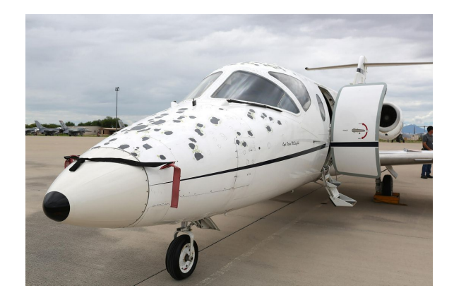
Raytheon Beechjet Hail Damage, and Pitot Covers

This cover type is made from Silver Acrylic Sunbrella canvas and is 100% lined with a soft and smooth microfiber. Bruce's Custom Covers developed this material combination especially for aircraft protection. The outer material is medium weight and treated for water resistance, UV resistance and anti-static buildup. The inner lining is a very soft and smooth microfiber to prevent scratching. The material is very reflective, and tests show that the cabin interior temperature can be reduced to near-ambient temperature on the hottest of days. It is water, ice and snow repellent, yet breathable to allow moisture to escape from between the cover and the aircraft surface.