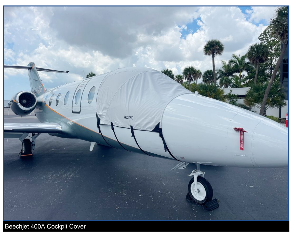
Section 1: Canopy/Cockpit/Fuselage Covers

The Hawker Beechcraft Beechjet 400, Hawker 400XP (T1A, T400 Jayhawk) Cockpit Cover helps reduce damage to the upholstery and avionics caused by excessive heat and can eliminate problems caused by leaking door and window seals. They keep the windshield and window surfaces clean and help prevent vandalism and theft.