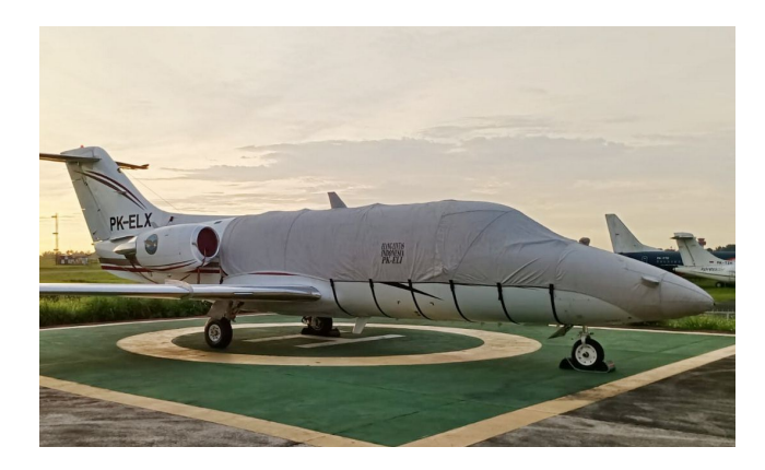
Beechjet Fuselage/Nose Cover

This cover type is made from Silver Acrylic Sunbrella canvas and is 100% lined with a soft and smooth microfiber. Bruce's Custom Covers developed this material combination especially for aircraft protection. The outer material is medium weight and treated for water resistance, UV resistance and anti-static buildup. The inner lining is a very soft and smooth microfiber to prevent scratching. The material is very reflective, and tests show that the cabin interior temperature can be reduced to near-ambient temperature on the hottest of days. It is water, ice and snow repellent, yet breathable to allow moisture to escape from between the cover and the aircraft surface.