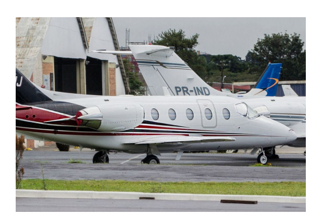
Beechjet Engine Plugs and Cockpit Heatshields