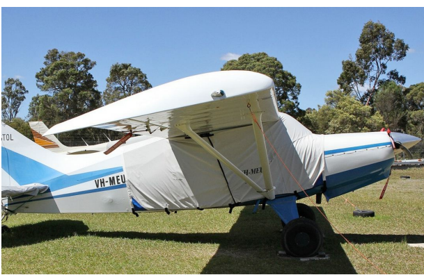
Maule M-5-235C Extended Canopy Cover Maule (All Models) Extended Canopy Cover (Over-Top Style), Specify Model & Year