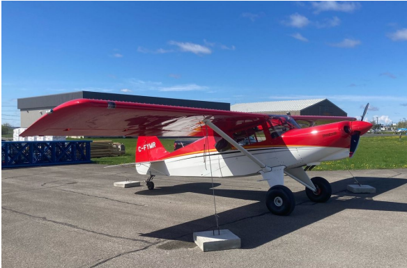
Bearhawk 4-Place Complete Cover Set, BEFORE

WINTER USE MATERIAL - Made with Solution-Dyed Polyester fabric, this option is intended for seasonal use to aid in deicing, rain mitigation, or for occasional travel. The material is lighter and more compact, but more susceptible to UV damage and may have a shorter useful life if used continuously outside than the all-year use material.